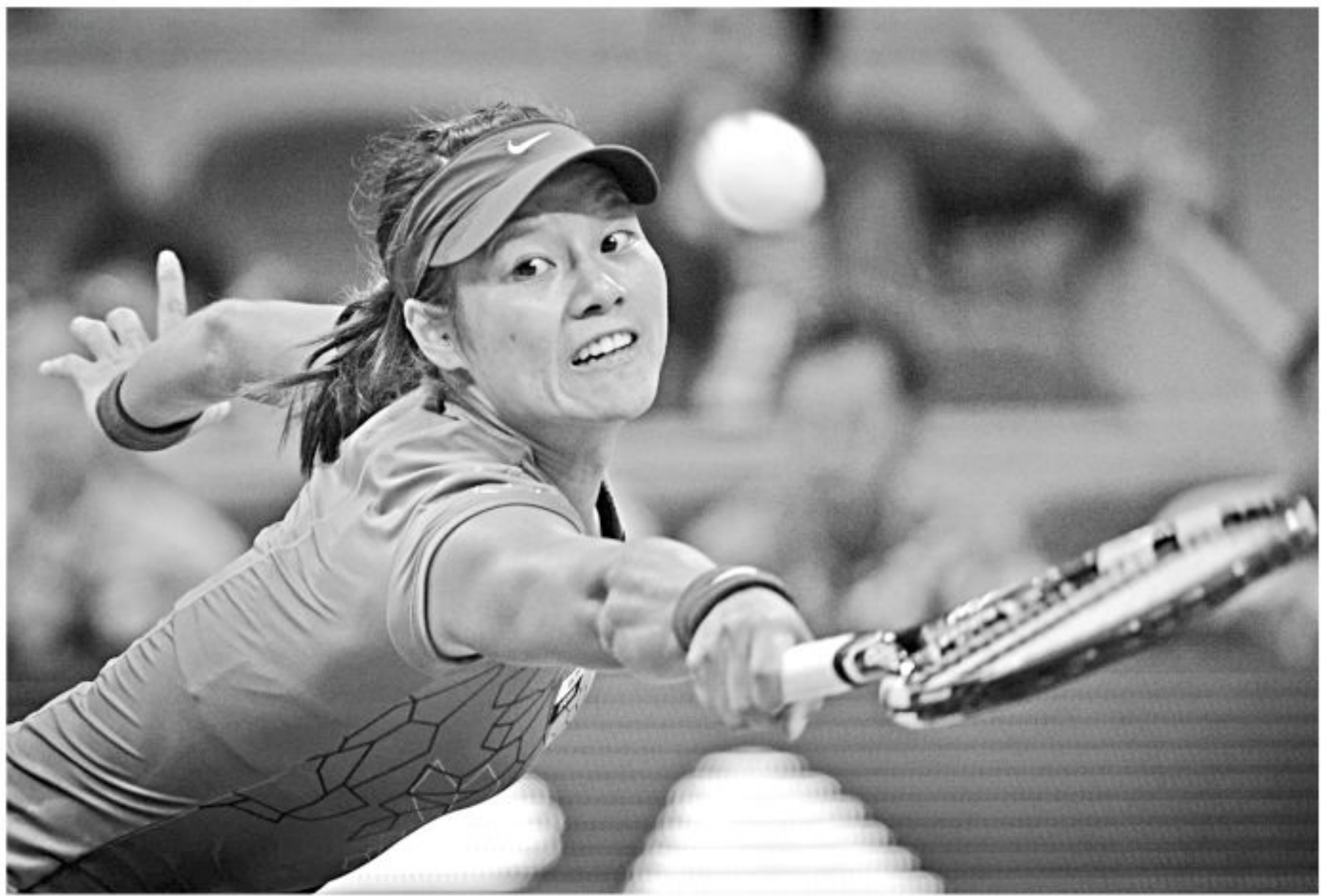
Li Na of China reaches for a backhand during the women's singles quarterfinal against Agnieszka Radwanska of Poland at the China Open in Beijing yesterday.