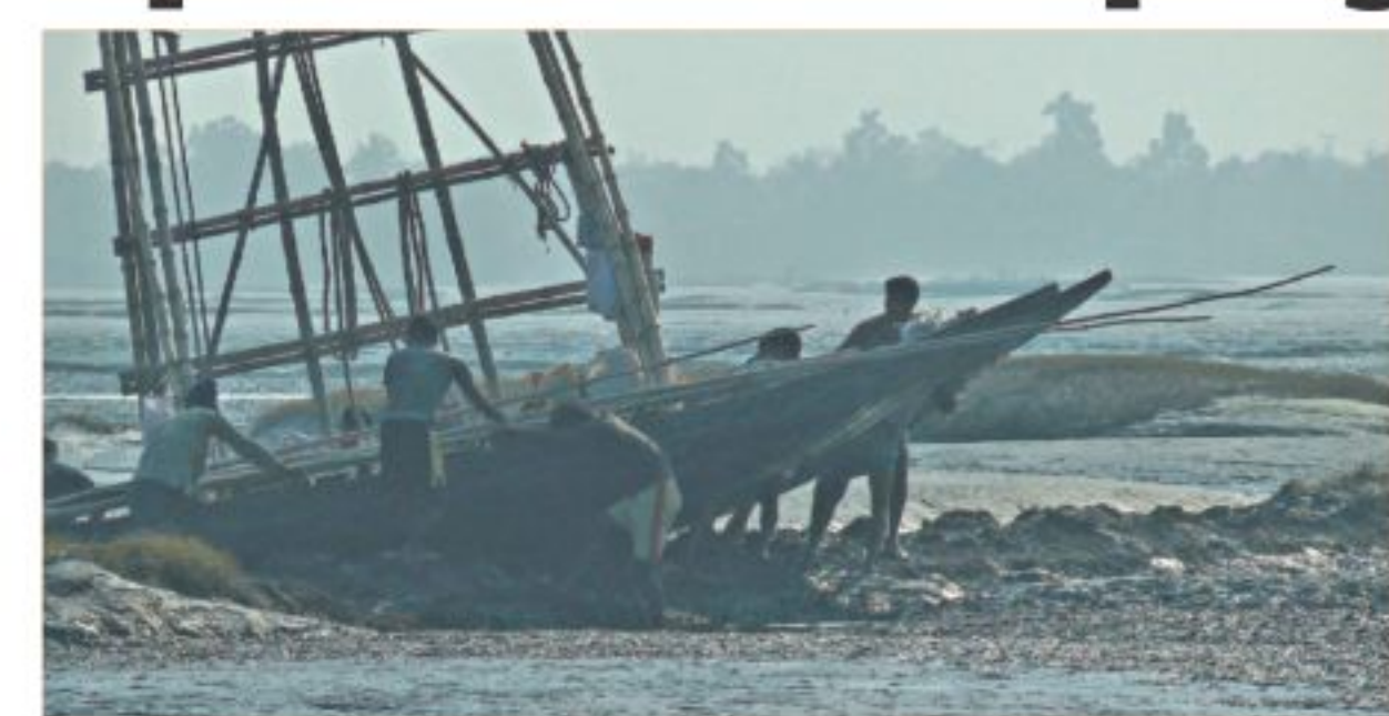
A scene from the documentary.