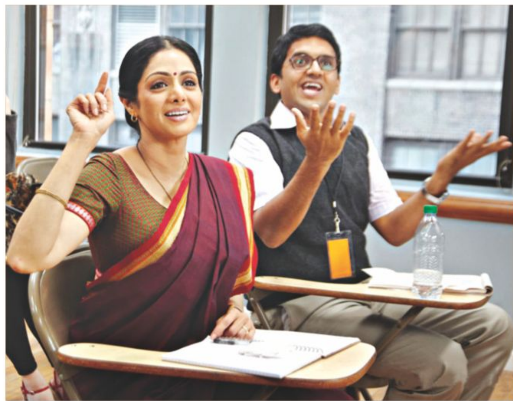
A scene from the film.

Sridevi has been away nearly fifteen years, and Hindi cinema has changed significantly, a fact perhaps most amusingly encapsulated by the way the actress gasps in this film on seeing a couple kiss in