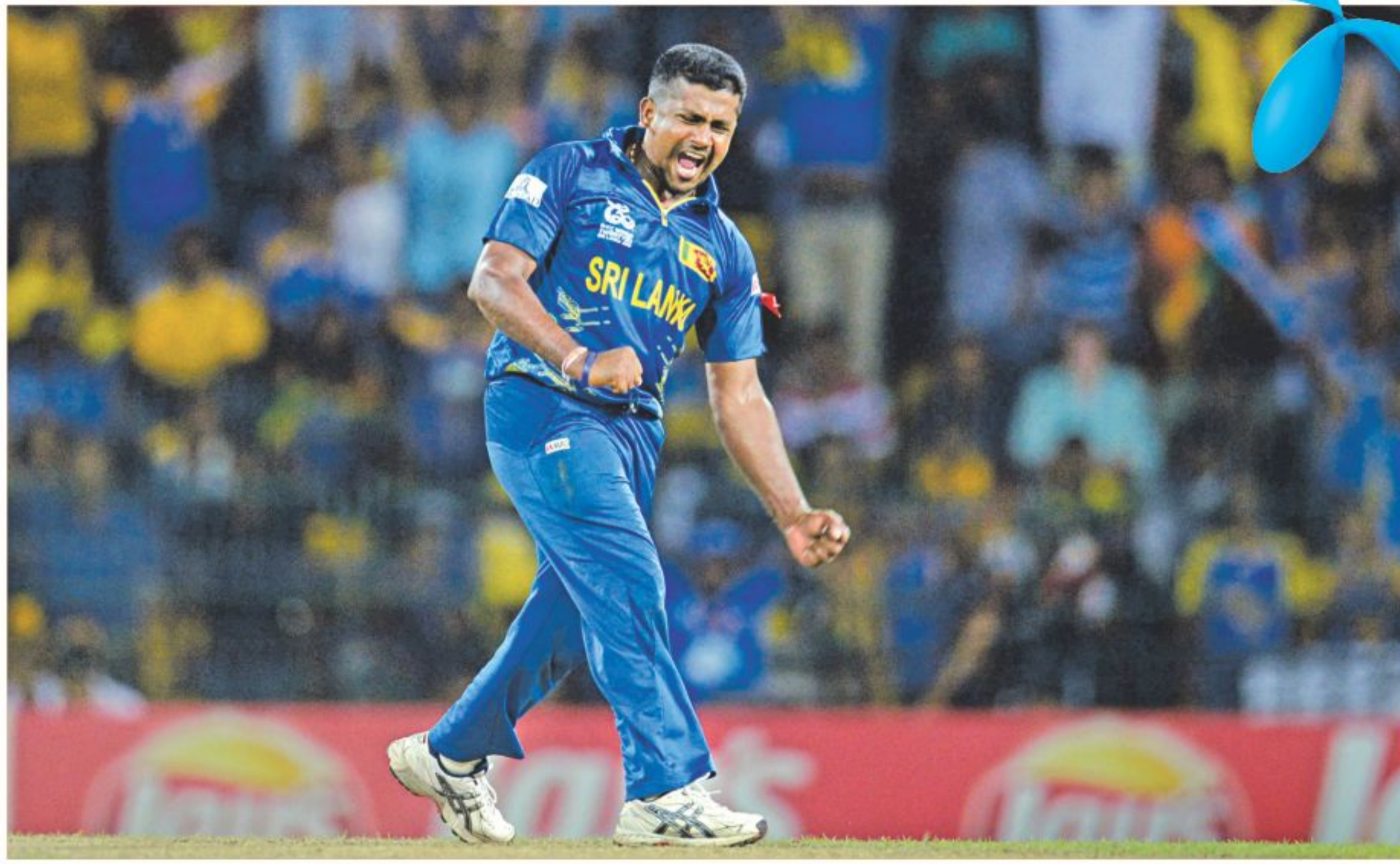
Sri Lanka's Rangana Herath punches the air after having Pakistan batsman Shoaib Malik clean bowled during their World T20 semifinal at the R Premadasa Stadium in Colombo on Thursday. The left-arm spinner turned the match around with three crucial wickets.