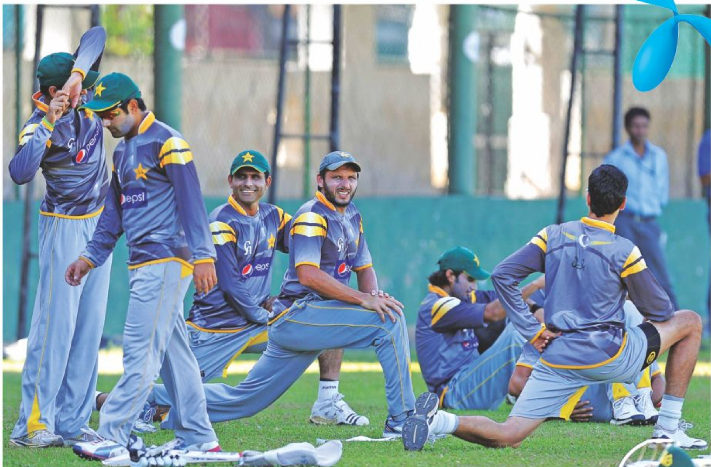
Pakistan cricketers do some stretching before a nets session in Colombo yesterday.