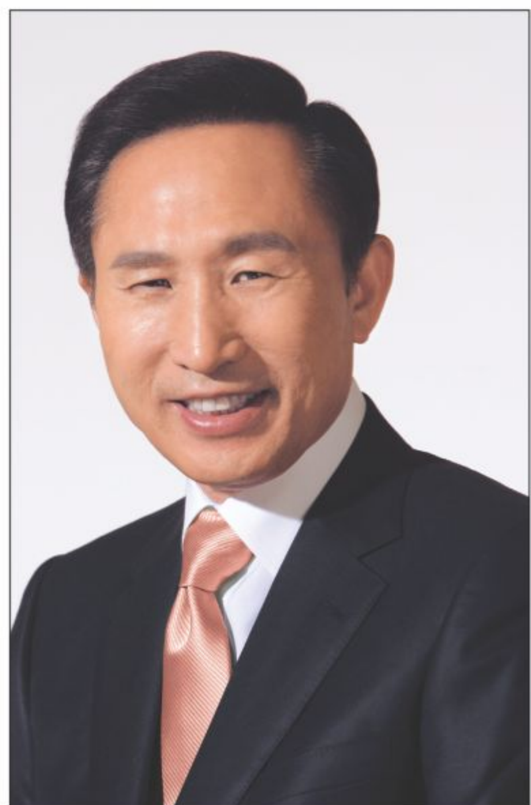
Lee Myung-bak President of the Republic of Korea

On behalf of the people and the government of the Republic of Korea, I would like to extend my warmest greetings to the government and people of Bangladesh on the auspicious occasion of the Korean