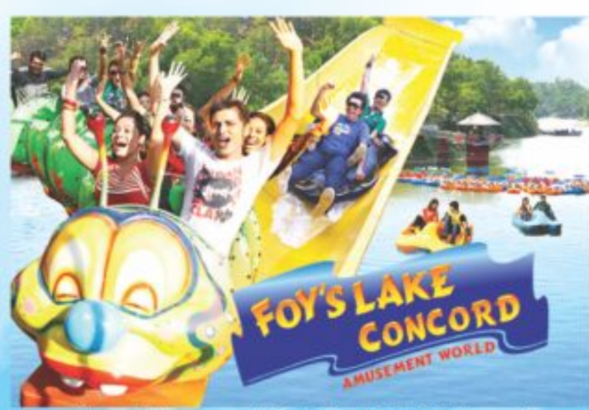
Concord Amusement World, Foy's Lake (Chittagong)