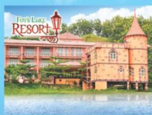
Foy's Lake Resort (Foy's Lake, Chittagong)