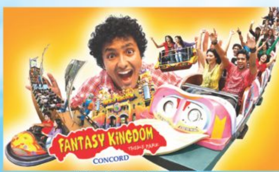
Fantasy Kingdom (Ashulia, Dhaka)

Concord is Bangladesh's leading construction conglomerate with over 1000 well-known projects to its name. Concord has set a standard in the construction and housing sector that is unmatched and has undertaken some of the most prestigious and technically challenging projects in the country. A few of Concord's projects are shown here.