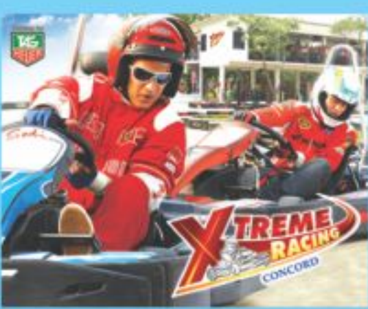
Xtreme Racing (Ashulia, Dhaka)