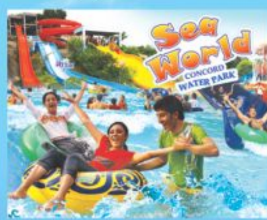
Sea World Concord (Foy's Lake, Chittagong)