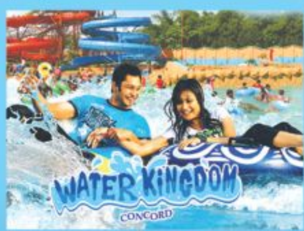
Water Kingdom (Ashulia, Dhaka)