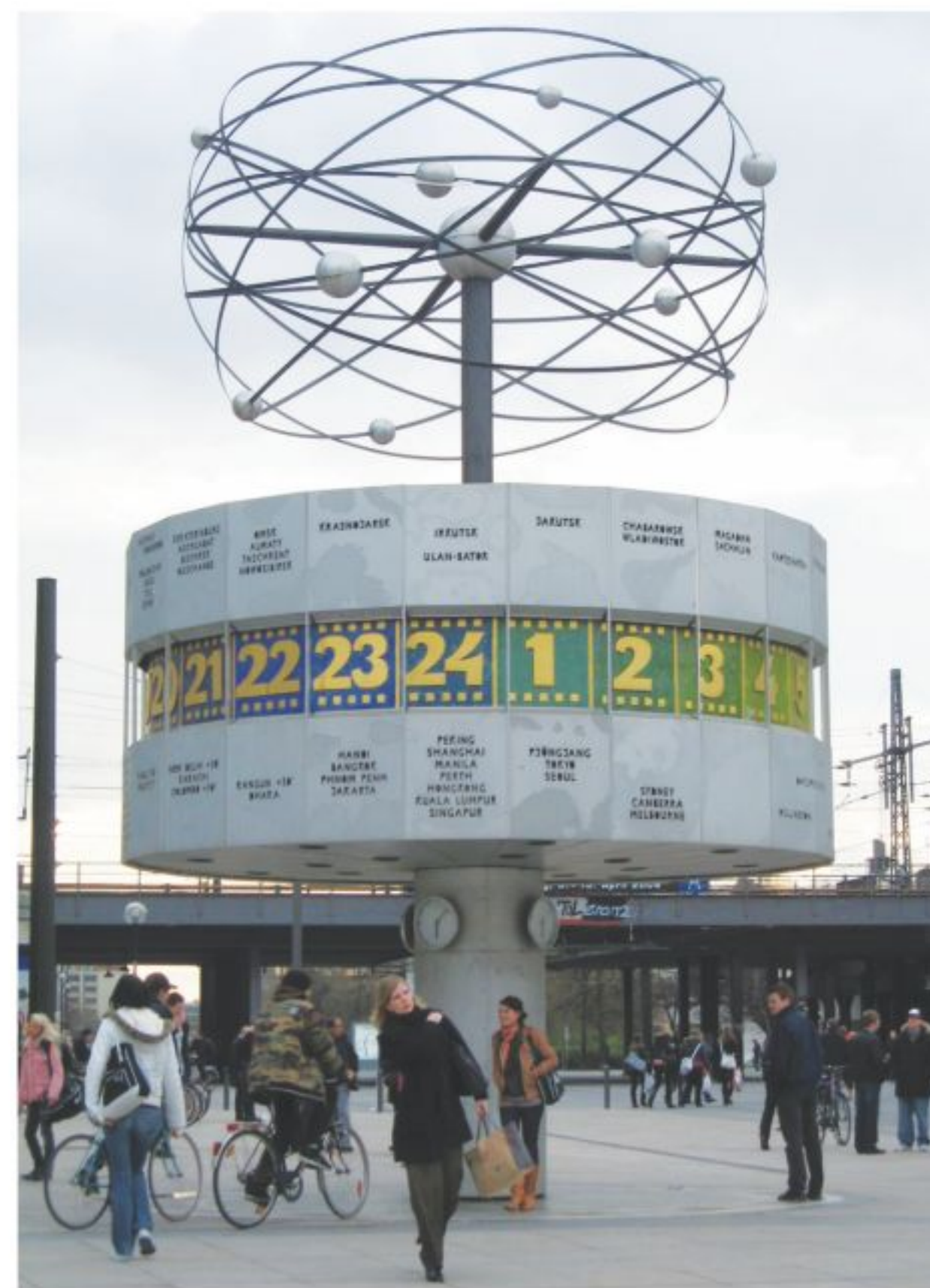
The Weltzeituhr (Worldtime clock) at Alexanderplatz Square, Berlin

The Climate Change Conference in Bali in 2007 laid the foundations for the so-called "post-Kyoto process" which, in addition to calling on the industrial nations to increase their protection on the agenda, also set new benchmarks for emerging nations to take their share of responsibility for climate protection. That is decisive, as according to the