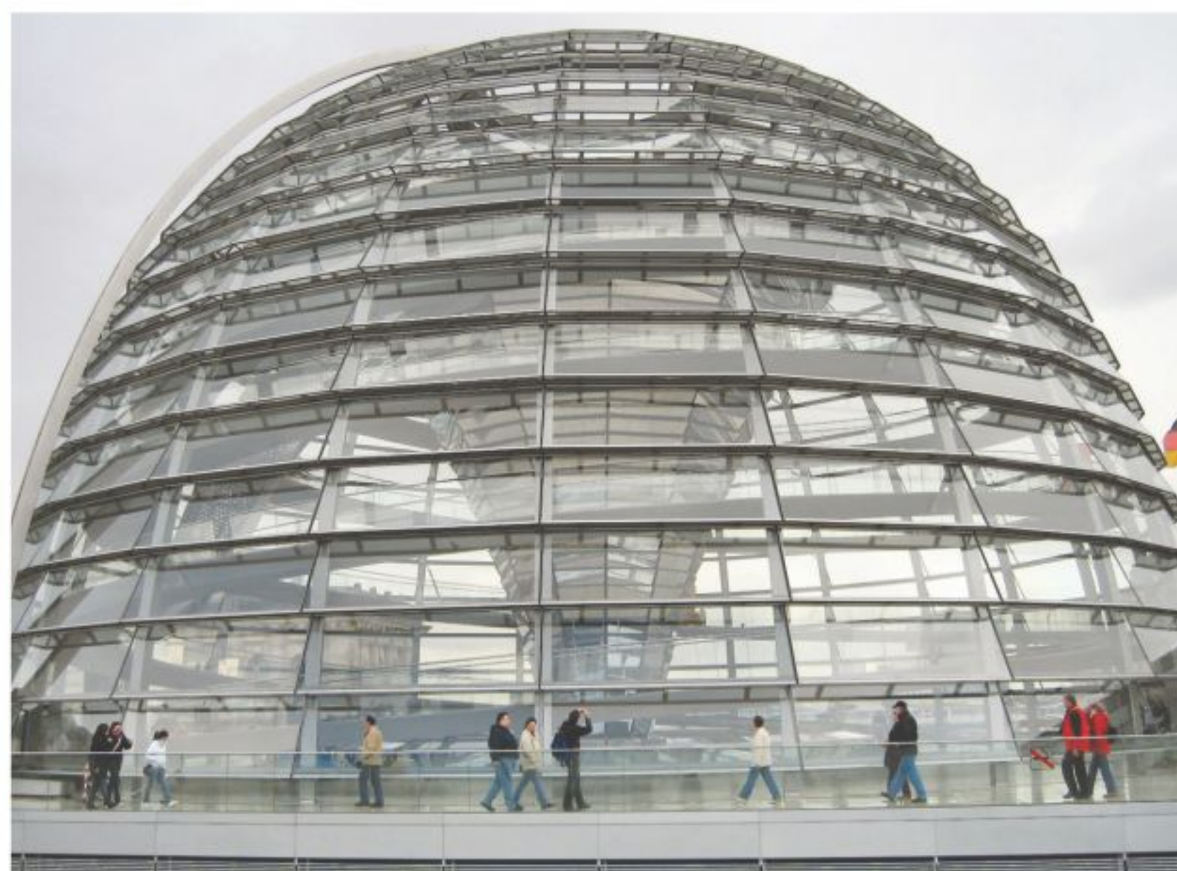
The capola of the Reichstag building (House of Parliament), Berlin