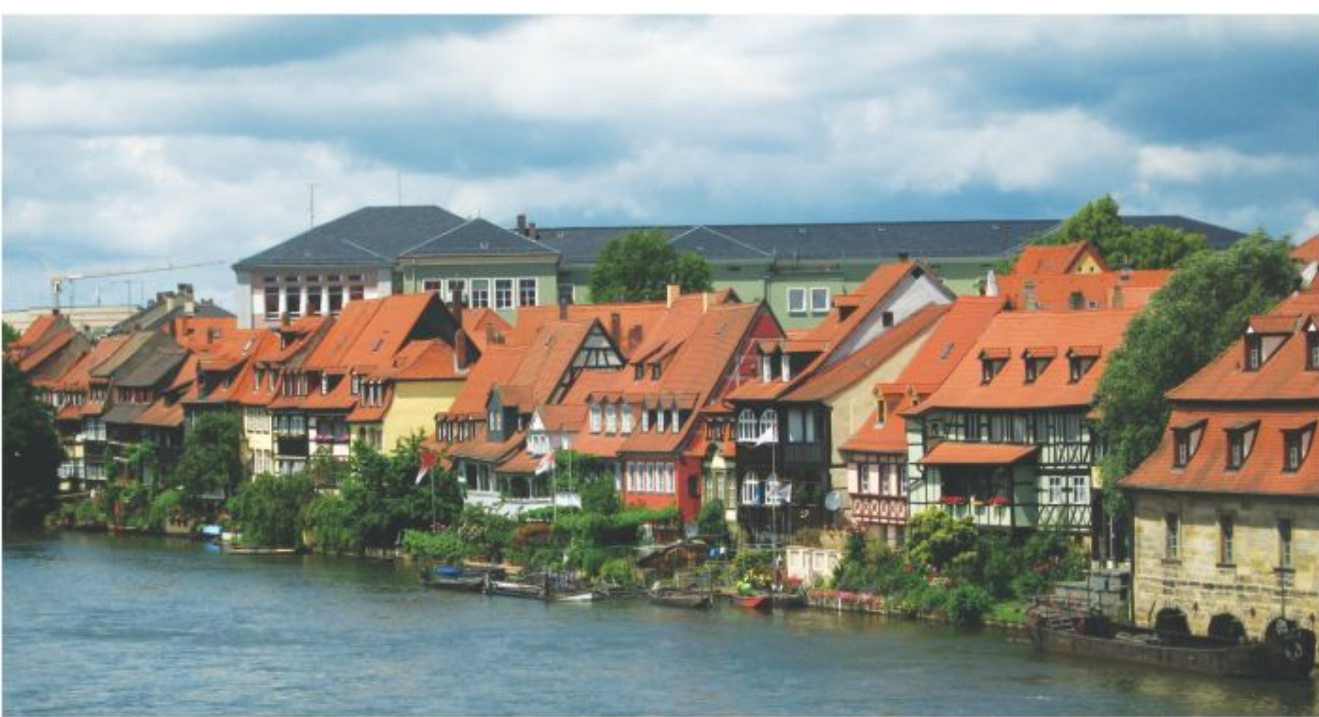
Historical City of Bamberg in Bavaria

These, however, are not enough to achieve the two degree target. The European Union has now assumed a pioneering role. It has agreed to lower, by 2020, the emission of greenhouse gases such as CO2 by at least 20 percent in comparison with the 1990 level or by 30 percent provided other industrial countries commit themselves to comparable reductions. The share of renewable energies is intended to rise to 20 percent and consumption to fall by 20 percent as a result of improved energy efficiency. The EU Climate and Energy Pact is being implemented in the 27 Member States in accordance with national quotas. Germany will make an above-average contribution to reducing greenhouse gases. Despite the difficulties on the way to finding compromise solutions the Federal