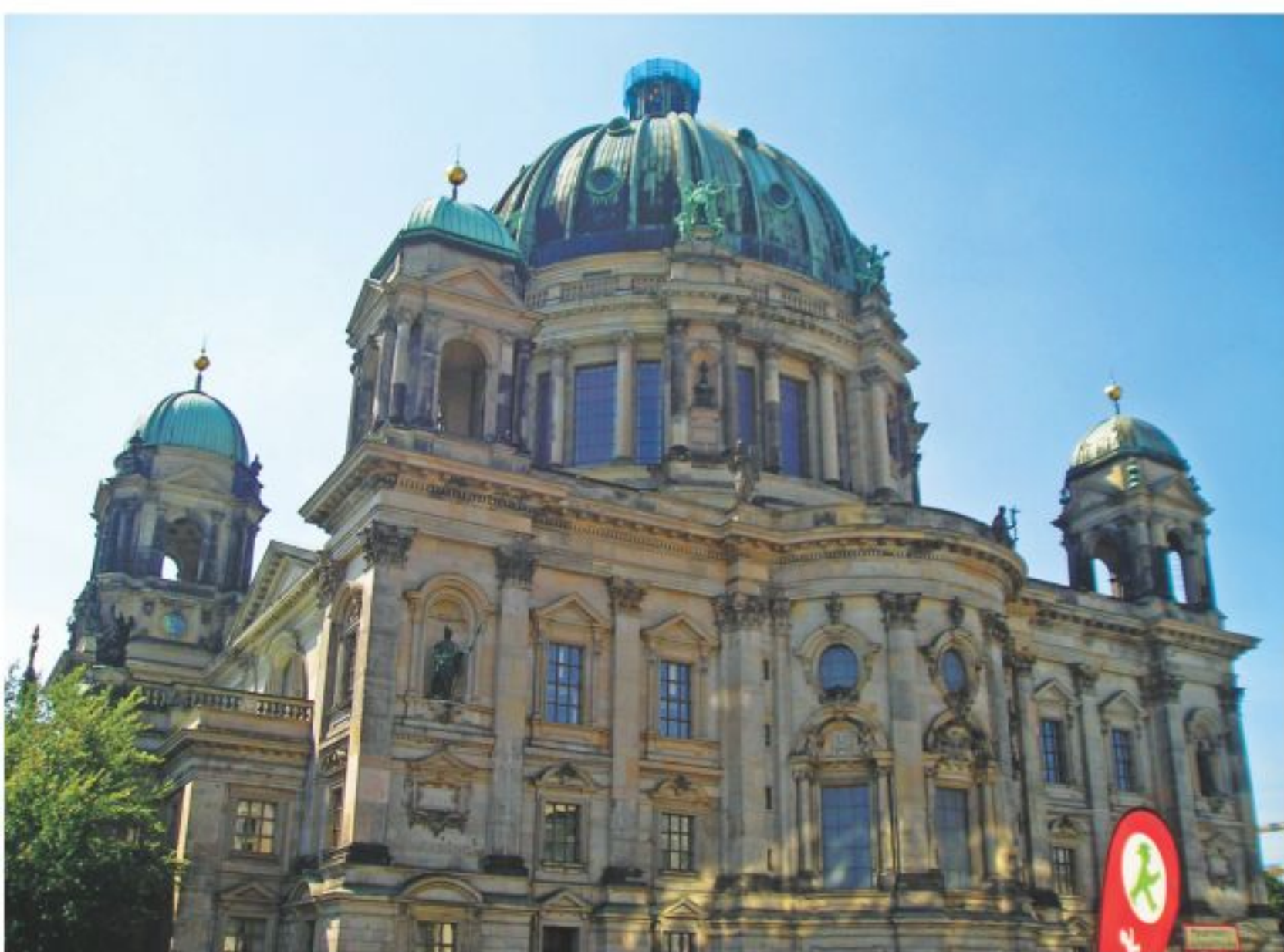
The Berlin Cathedral