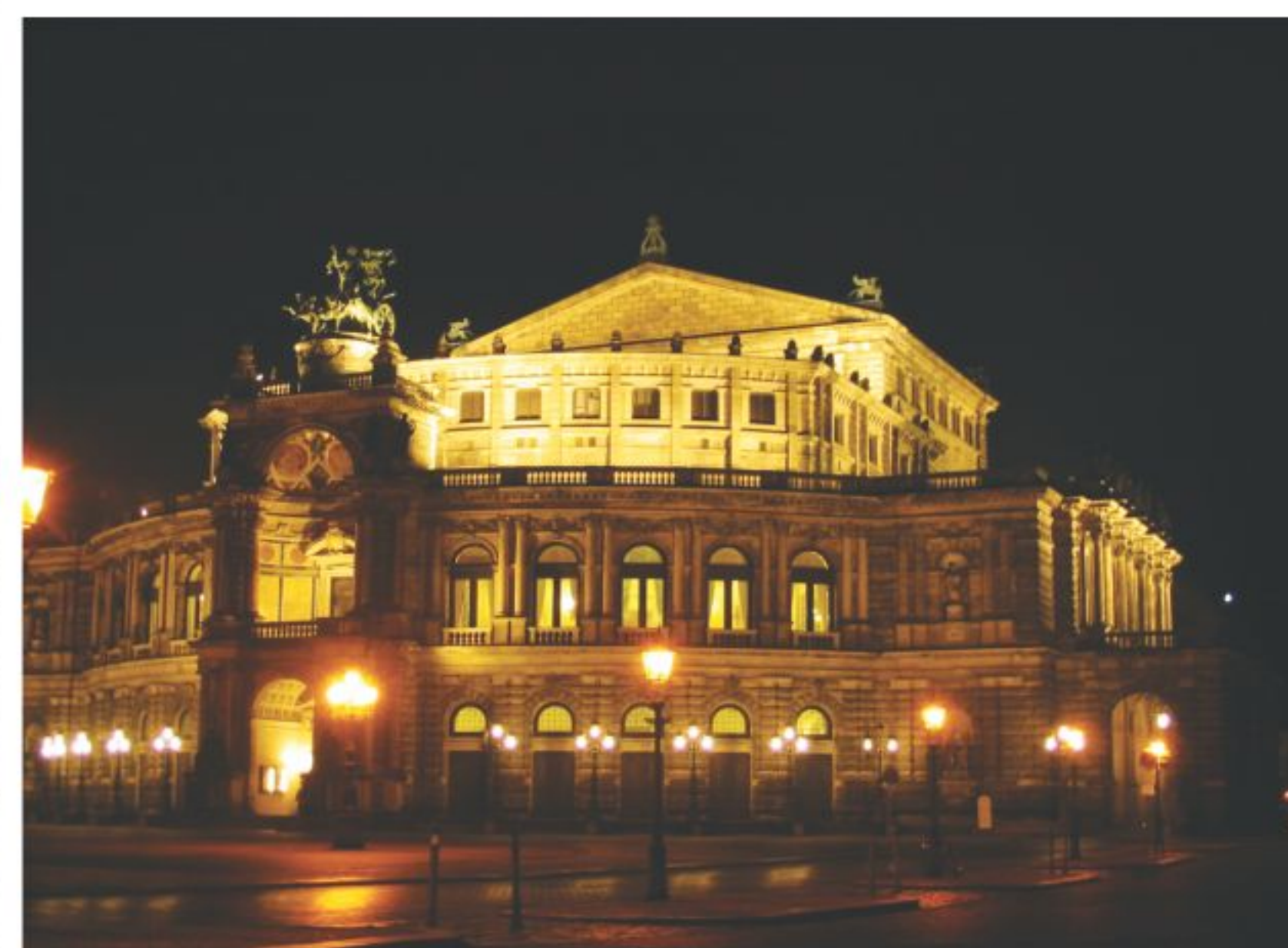
The Semperoper Opera, Dresden