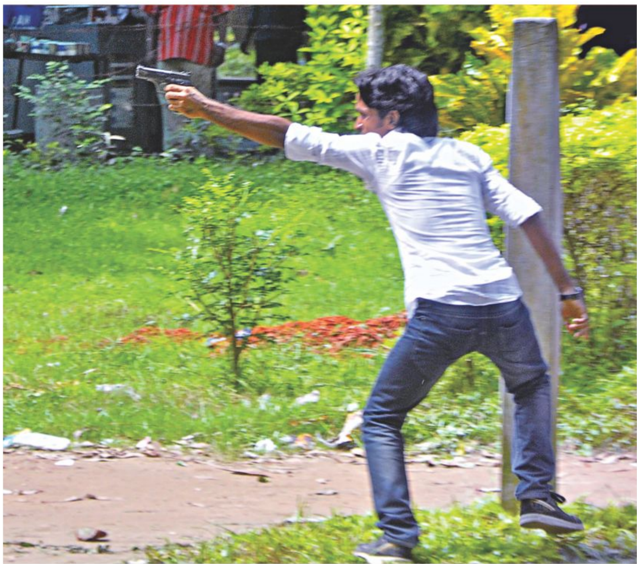
Jamaat-e-Islami backed Islamic Chhatra Shibir and ruling Awami League backed Bangladesh Chhatra League activists of Rajshahi University use guns and sharp weapons in a fierce clash on the campus yesterday leaving at least 25 students injured. The clash ensued after Shibir men disrupted a procession of BCL. (Story on Page 1)