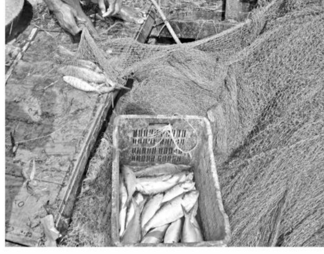
Fishermen catch hilsa from Ramnabad River in Galachipa upazila under Patuakhali district, ignoring the ongoing ban on netting the popular fish during the peak breeding period. Inset, a catch of the fish netted from Tentulia River at Char Wadel in Baufal upazila under the same district.