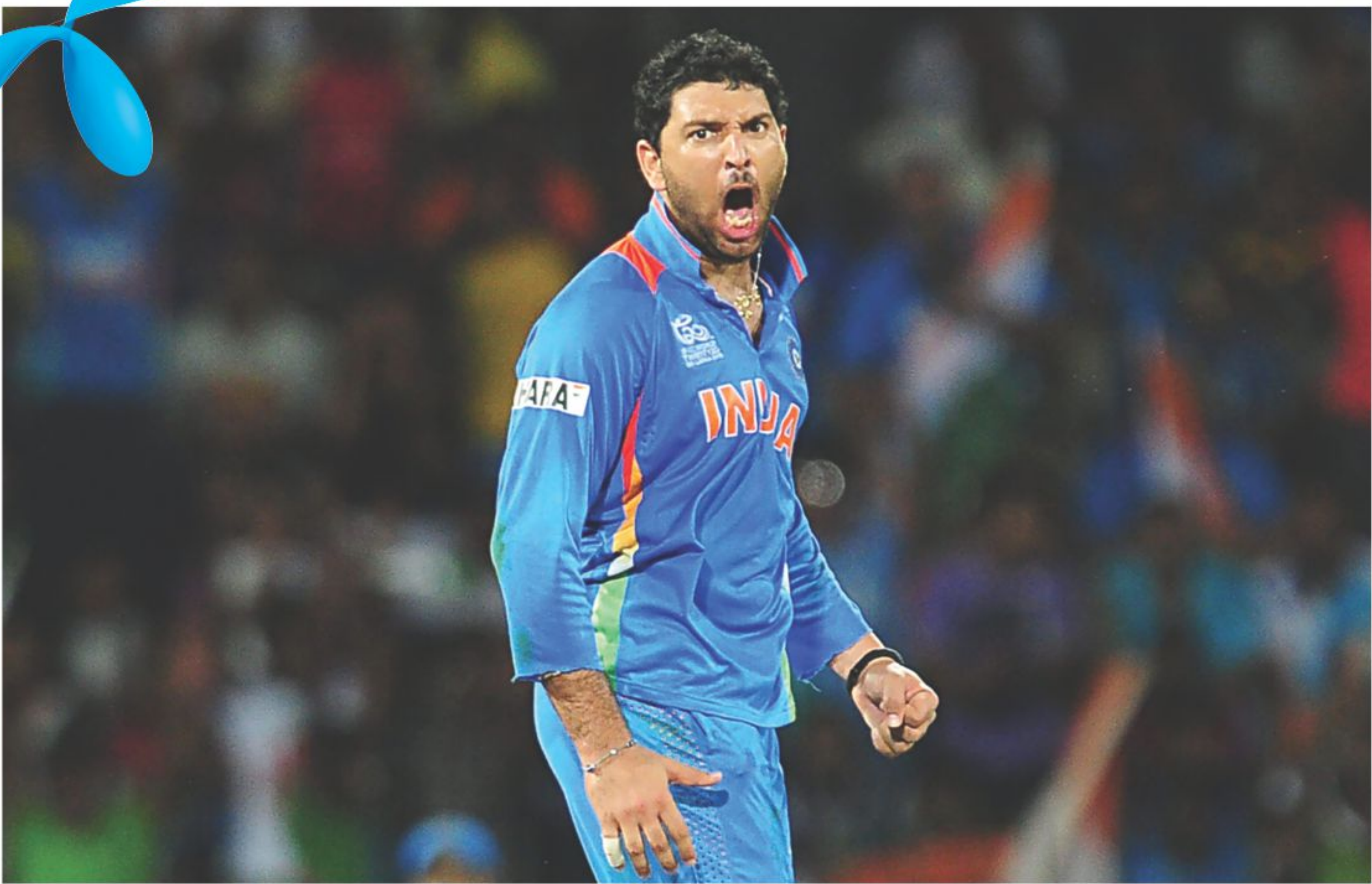
Cancer survivor India all-rounder Yuvraj Singh roars after dismissing Pakistan batsman Kamran Akmal (unseen) during their World T20 Super Eights match at the R Premadasa Stadium in Colombo yesterday.