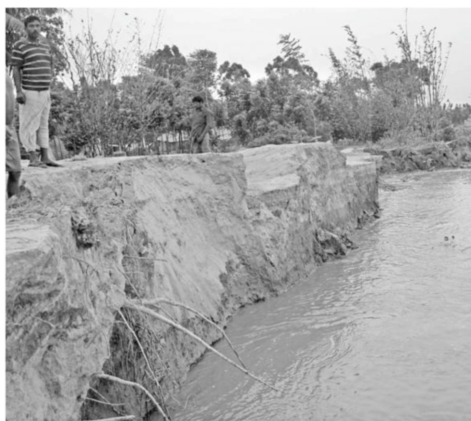
Rain-fed Madhumati River devours areas including Kamarkhali-Bakshipur embankment at Gayeshpur village in Madhukhali upazila of Faridpur district, right, a few villagers shift a wooden house to a safer place following continued erosion for the last four days.