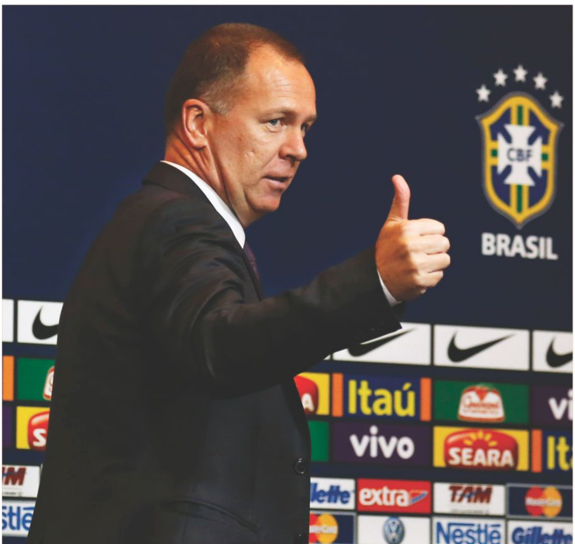
Brazil coach Mano Menezes gives the thumbs up after a news conference in Rio de Janeiro on Thursday.