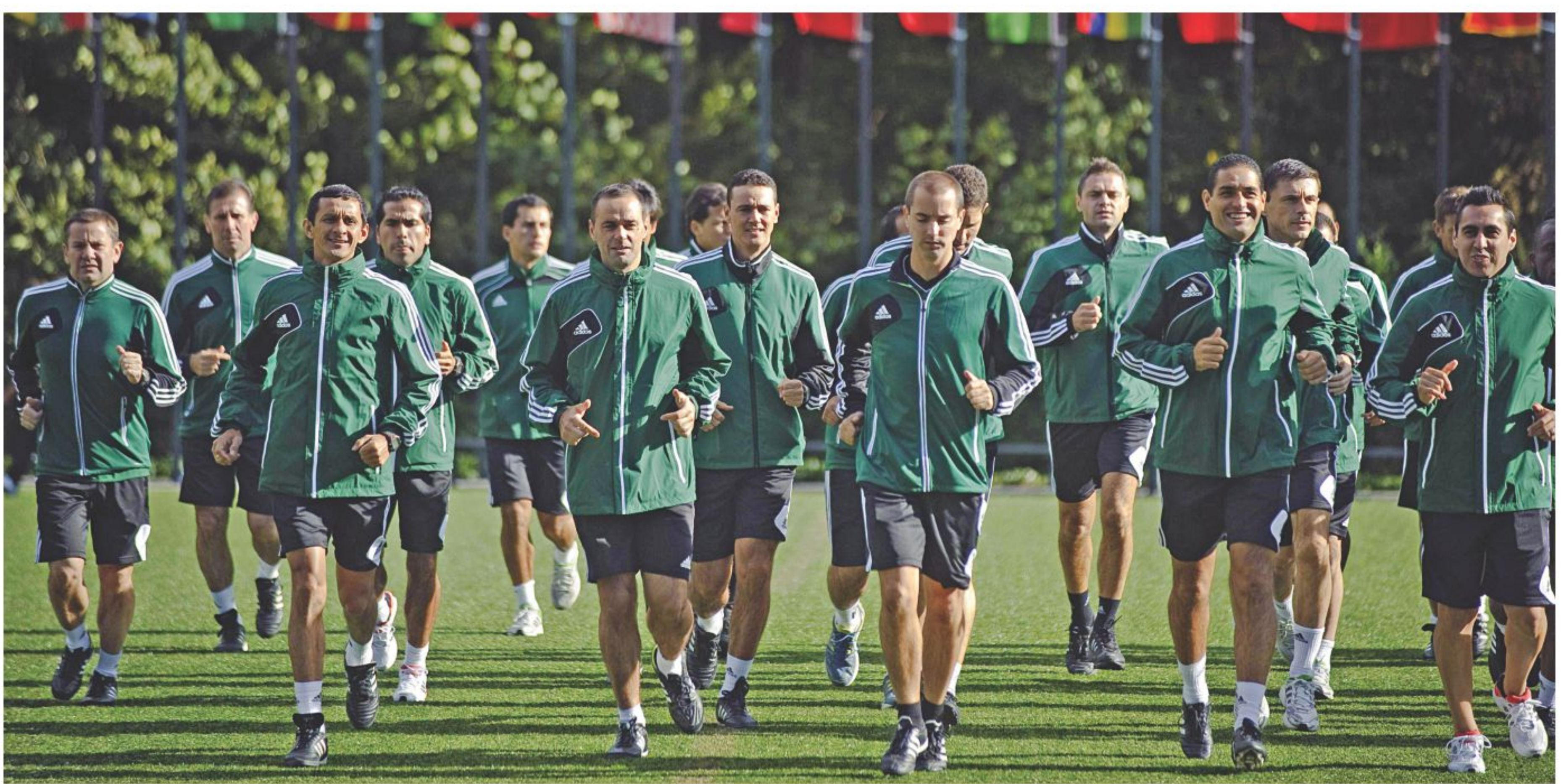
Football match officials jog during a meeting of potential referees for the 2014 World Cup in Zurich on Thursday.