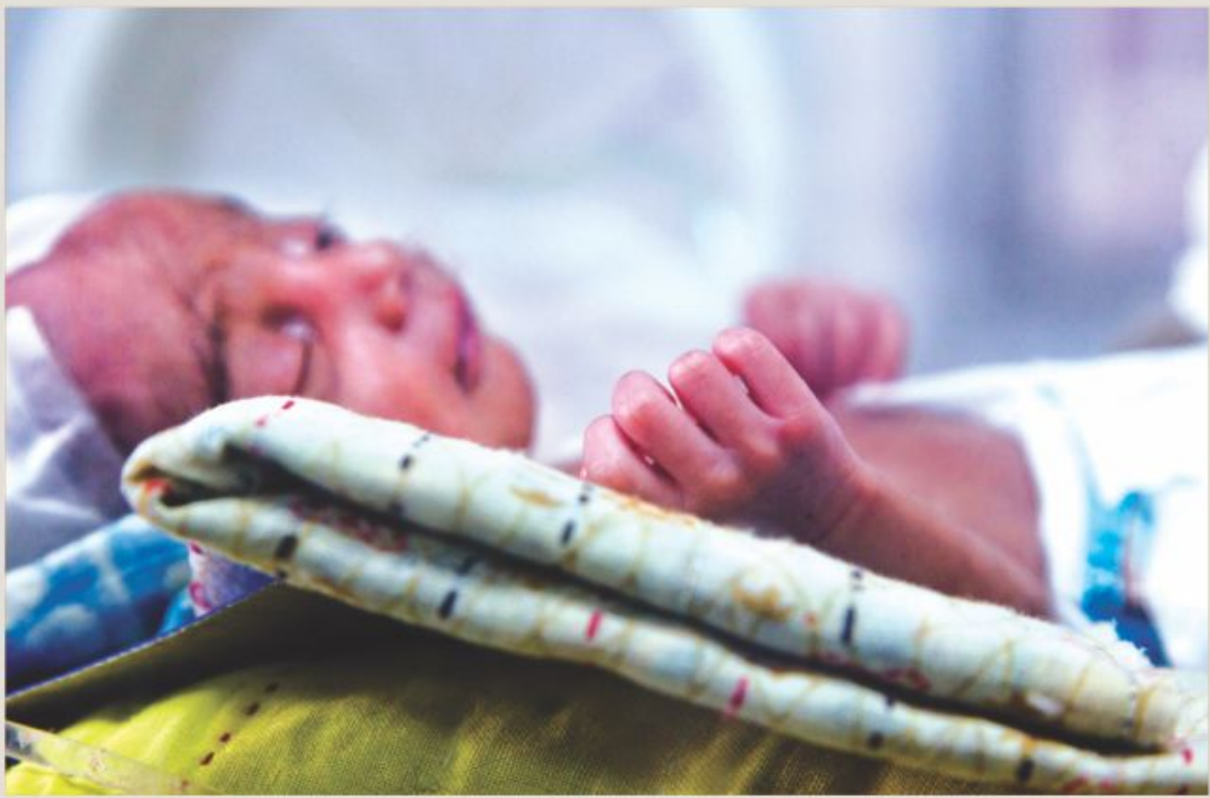
Premature baby at the ICU.