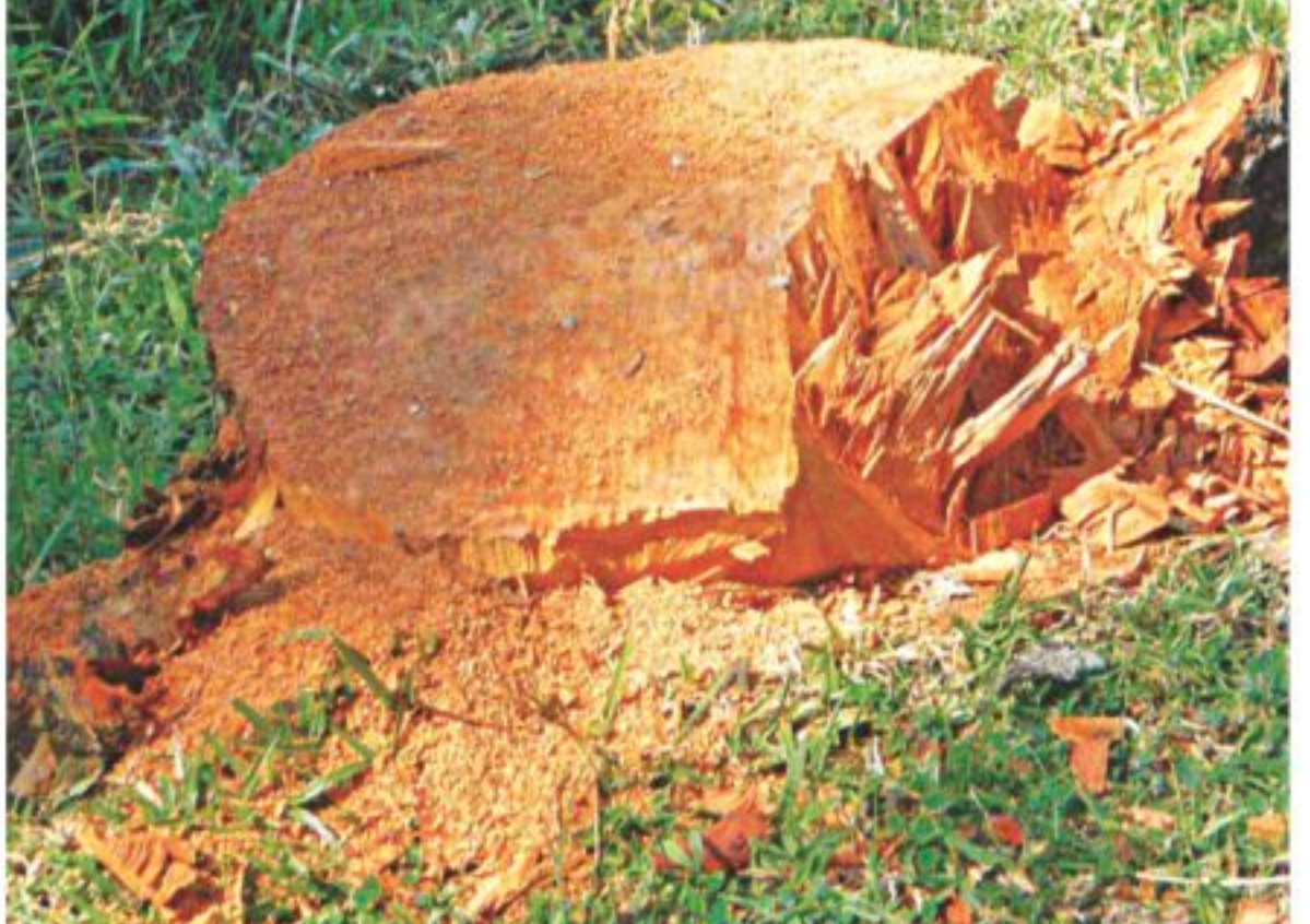
Remains of trunks bear testimony to felling of 24 large trees on both sides of Kalapara-Londa road in Kalapara upazila of Patuakhali district on Tuesday, allegedly by local Awami League men.

During the tree felling from morning to noon, local people saw the matter but nobody dared to prevent the perpetrators as they are ruling party men. Kalapara upazila unit of Muktiyoddha Sangsad planted those trees around 30 years ago and the upazila parishad had been maintaining the trees.