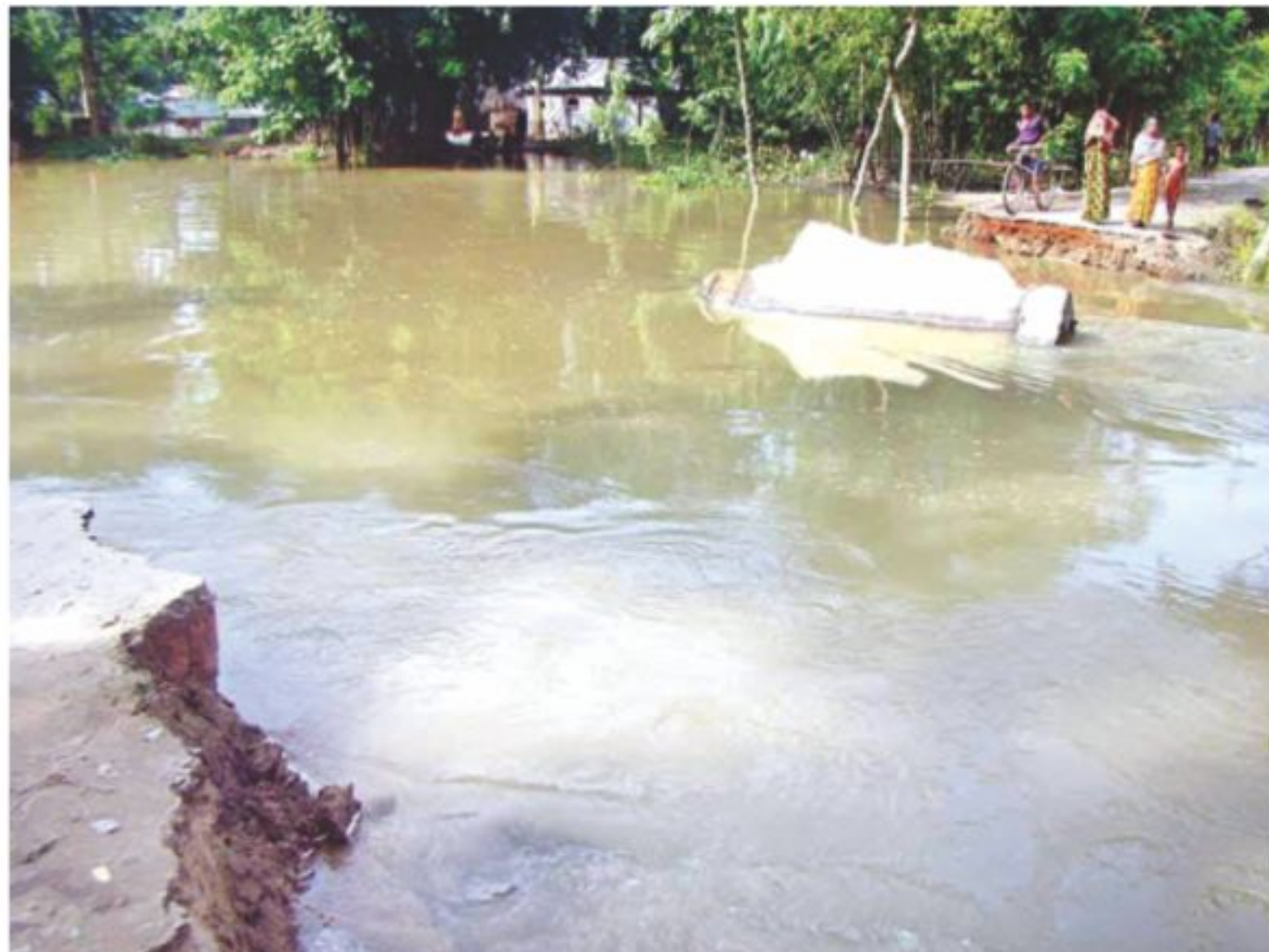
Elachipur in Shibalaya upazila under Manikganj district gets flooded following breach of embankment under the impact of strong current in the Padma, right, floodwater washes away part of Kholahati-Chapadaha-Sadullapur-Joinpur road in Gaibandha Sadar upazila yesterday.