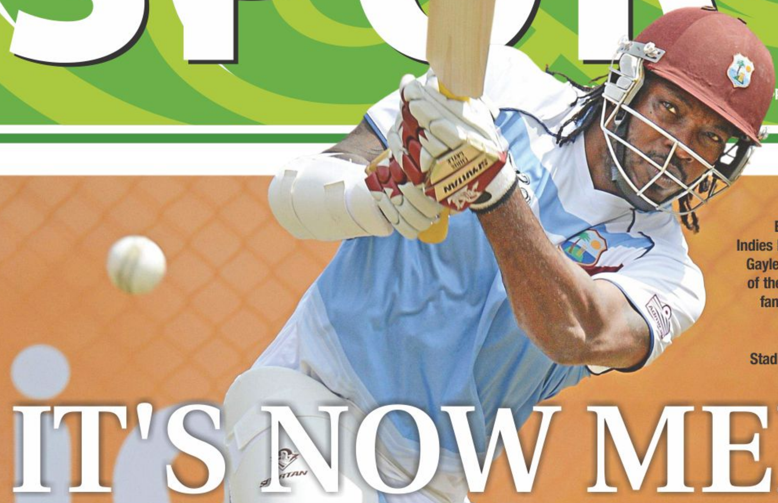
Explosive West Indies batsman Chris Gayle practises one of the big hits he is famous for at the Pallekele International Stadium yesterday.