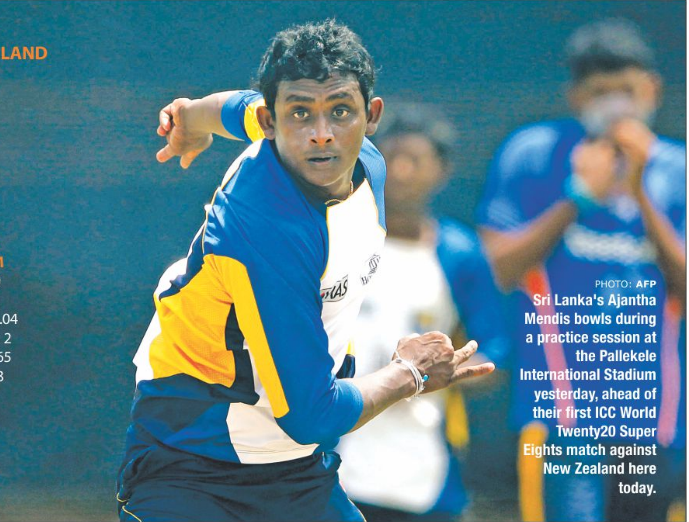
Sri Lanka's Ajantha Mendis bowls during a practice session at the Pallekele International Stadium yesterday, ahead of their first ICC World Twenty20 Super Eights match against New Zealand here today.