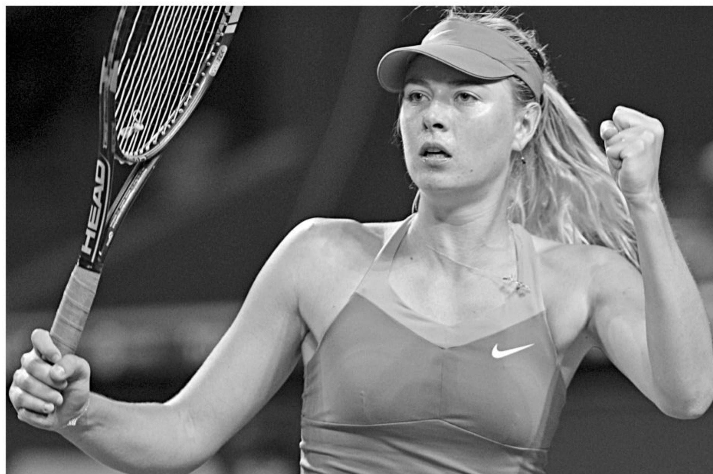
Russian glamourgirl Maria Sharapova celebrates her victory against Heather Watson of Britain in their second round match of the Pan Pacific Open in Tokyo on Tuesday. Sharapova won 6-7, 6-3, 6-4.

West Indies captain Darren Sammy has warned England that his team can play "unbeatable" World Twenty20 cricket. Reigning T20 world champions England face Sammy's side in their first Super Eight game in Pallekele on Thursday. West Indies knocked out Ireland to reach this stage and all-rounder Sammy told BBC Sport: "I'm quite confident that we can go all the way in this tournament." "When we left the Caribbean, we left with one goal -- to win the World T20."