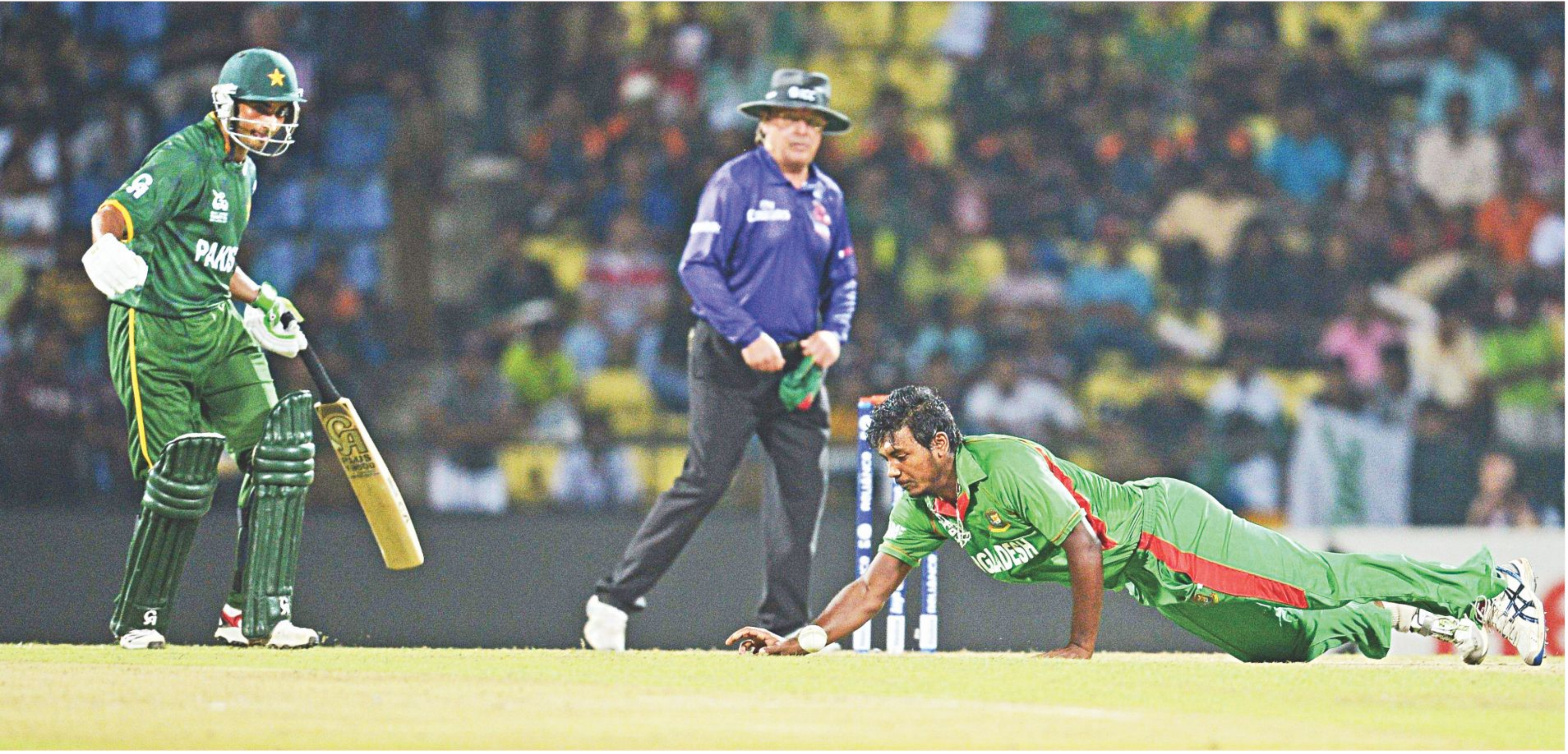
Young Bangladesh paceman Abul Hasan makes a desperate dive to stop the ball as Pakistan opener Imran Nazir looks on during their World Twenty20 match at the Pallekele International Cricket Stadium in Kandy yesterday. Nazir, who was dropped by Hasan while on one only, made the most of the gaffe with a blazing 72 off 36 balls as Pakistan coasted to an eight-wicket win.