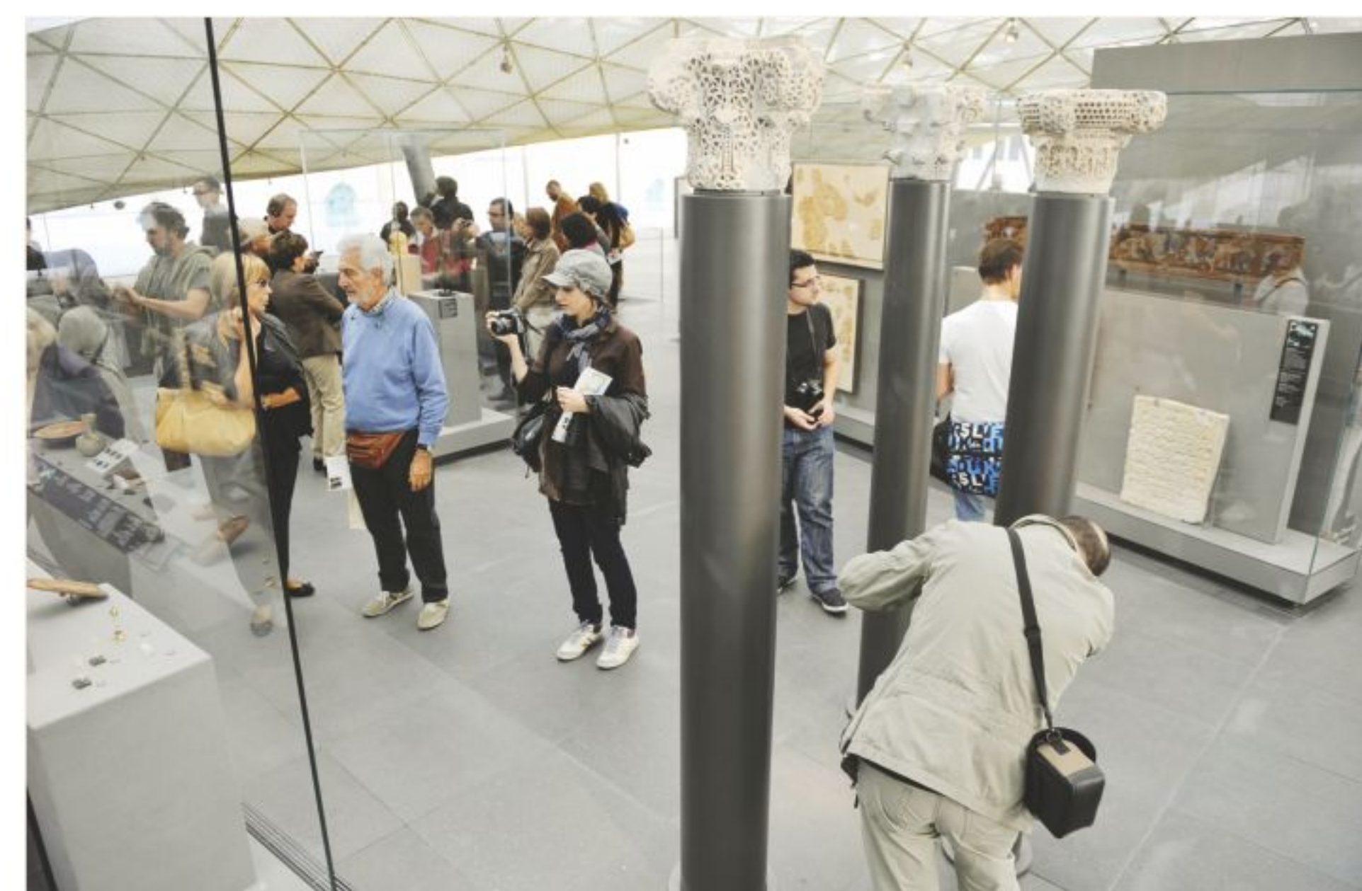
People look at pieces during their visit at the new Department of Islamic Arts at the Louvre Museum, on September 22, 2012 in Paris.

"We must give back the word Islam its full