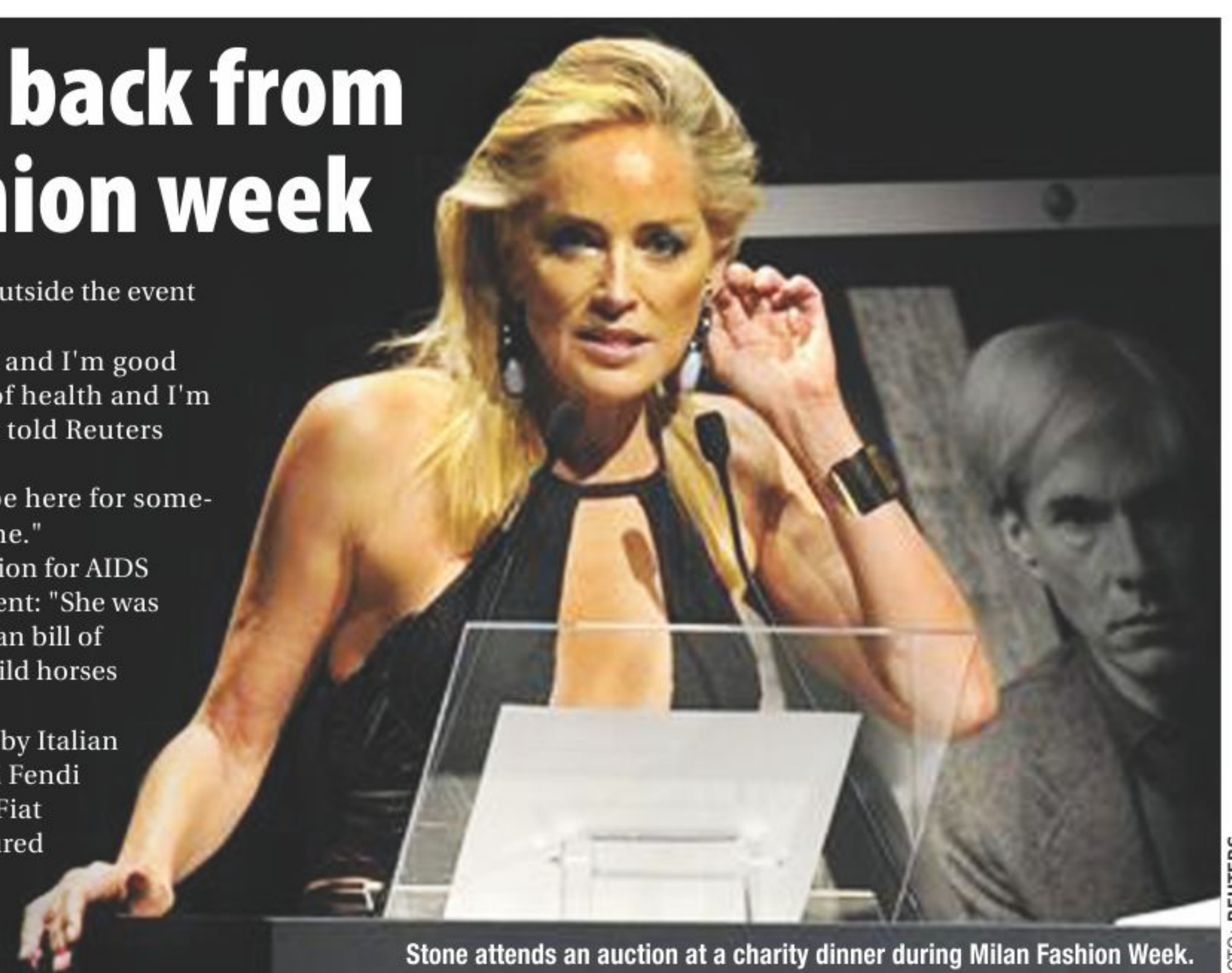
Stone attends an auction at a charity dinner during Milan Fashion Week.