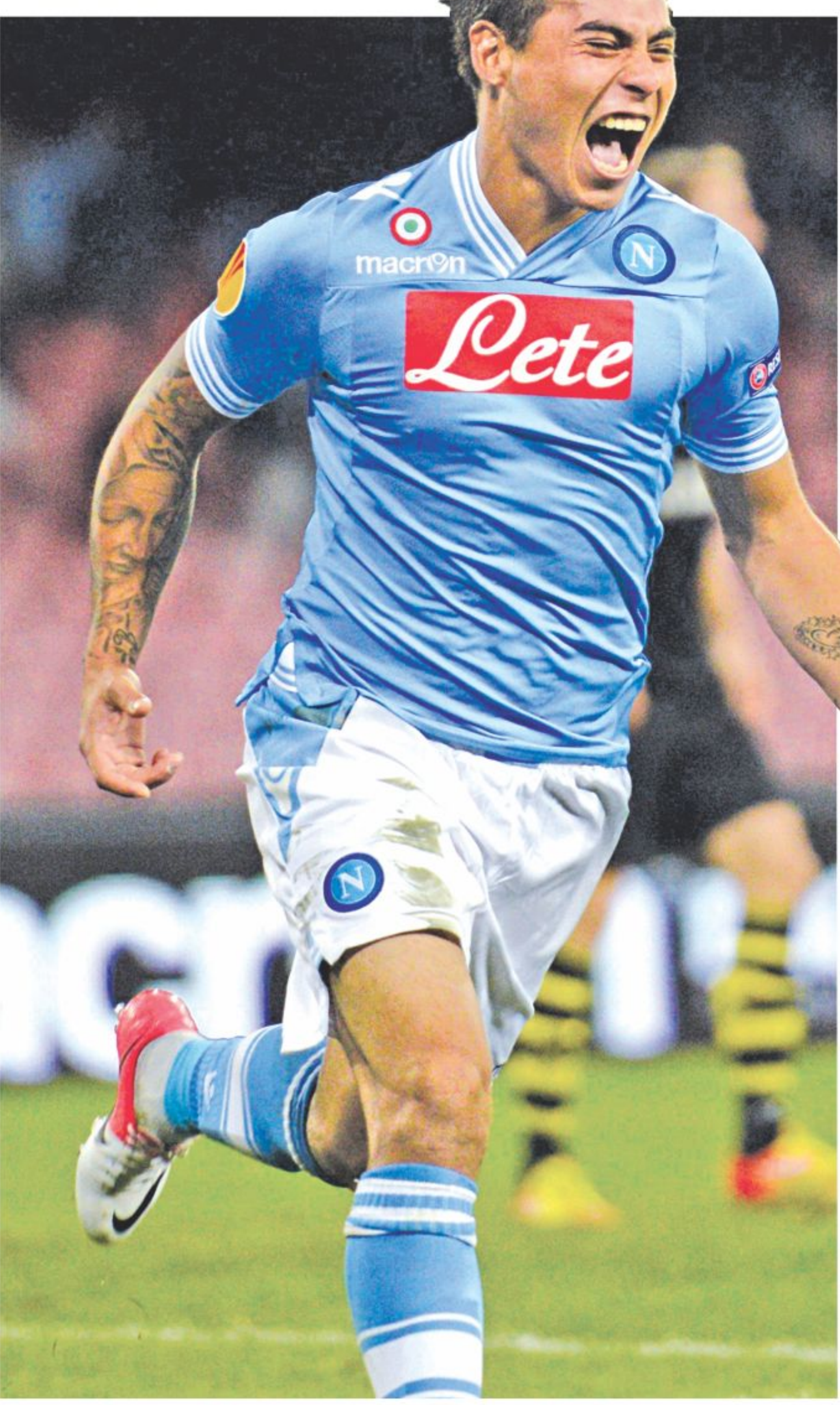
Napoli striker Edu Vargas is ecstatic after scoring one of his three goals against AIK Solna during their Europa League Group F match at the San Paolo Stadium on Thursday.

AFP, Rio de Janeiro Brazil football great Ronaldo who, like half of his country's population, is overweight, is to star in a television reality show that will chronicle his battle against the bulge. For three months the portly ex-striker, now a member of Brazil's 2014 World Cup organizing committee, will submit to a series of physical exercises and dietary re-education which will be aired every Sunday. "I have problems with the weighing scales. It's a real trauma," the Globo channel's G1 website quoted the 35-year-old star as saying. "I have already tackled many challenges and this one will not be easy. Those who have already tried to lose weight know that. But I am getting on with it in high spirits," added Ronaldo. He retired last year and disclosed that he had long been suffering from thyroid problems, which caused him to gain a great deal of weight. Ronaldo said he wanted to be fit for an annual charity match in which he will take part along with his ex-Real Madrid teammate and French soccer legend Zinedine Zidane in the southern Brazilian city of Porto Alegre this year. Ronaldo played for Brazil in 98 international matches, scoring 62 goals and was part of the national squad that won the 1994 and 2002 World Cups. He retired prematurely after suffering many knee injuries.