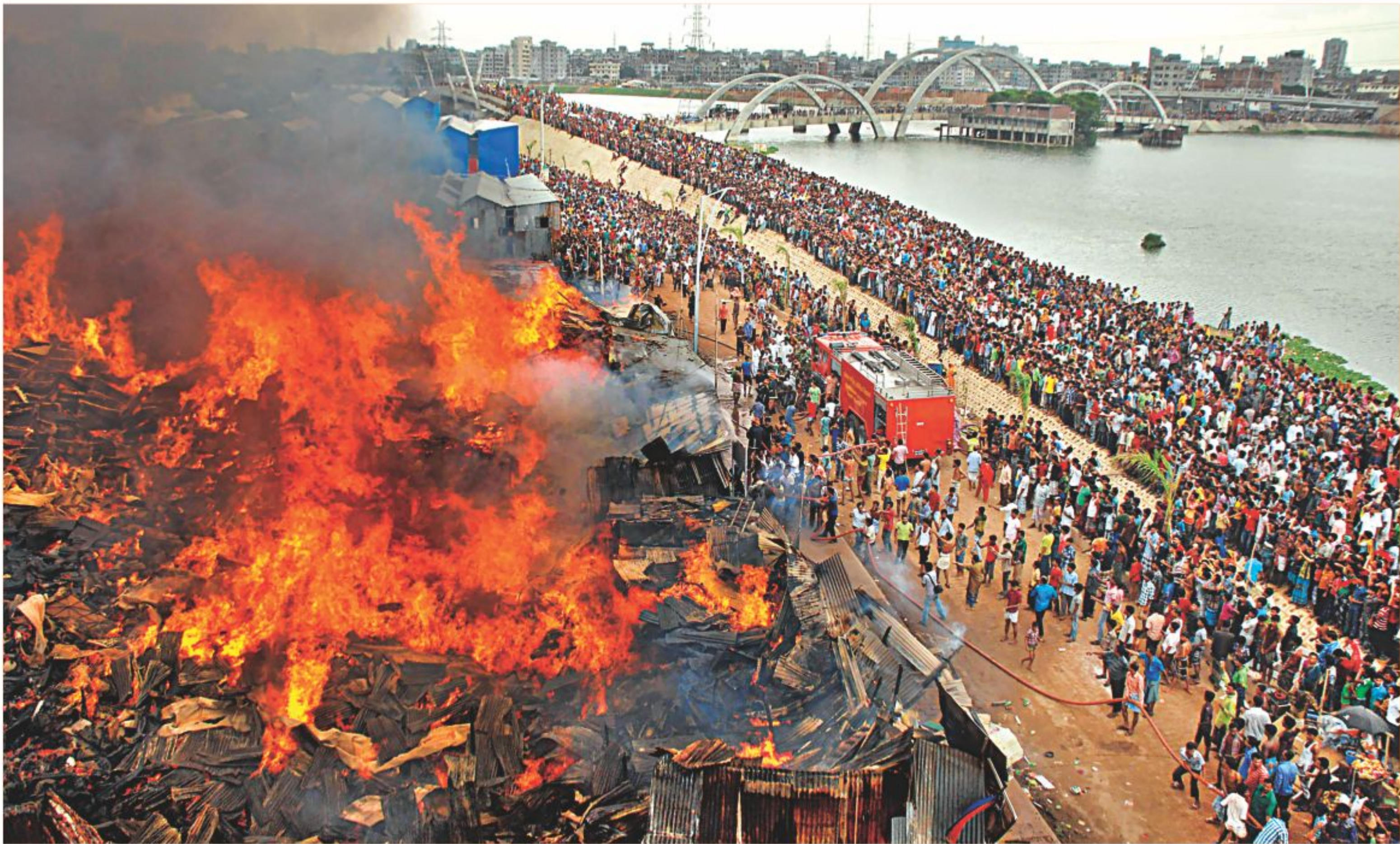
Fire engulfs Begunbari slum near Hatirjheel of Tejgaon, razing around 400 shanties made of tin and wood. No casualties were reported in the fire which originated yesterday morning but put the lives of around two thousand dwellers in uncertainty. Story on page 19.