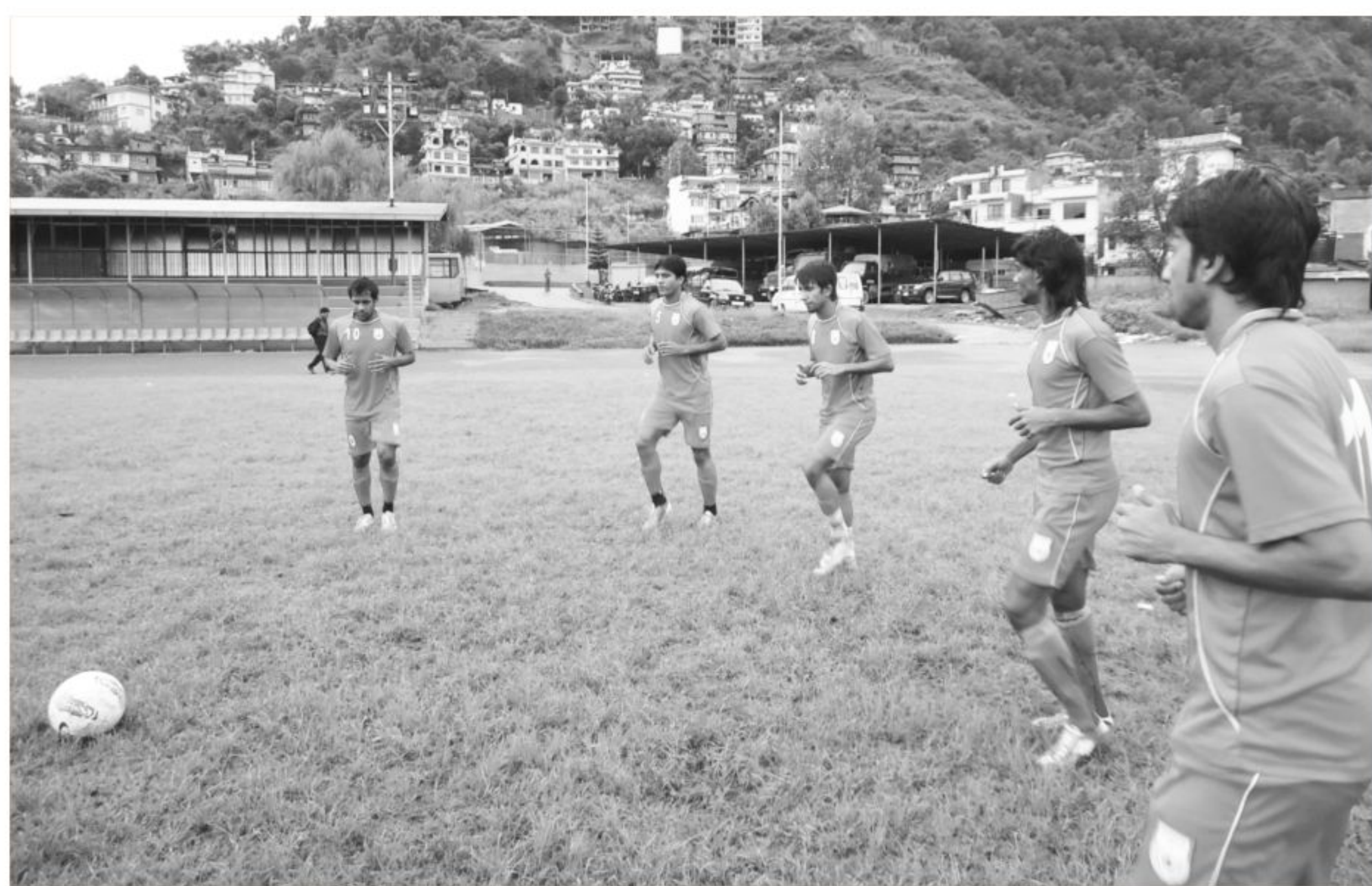
Bangladesh national football team players engage in a light practice session at the Nepal Police Sports Ground in Kathmandu yesterday, after the scheduled match against the Nepal national team was called off due to heavy rain.