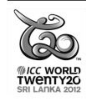
ICC WORLD TWENTY20 SRI LANKA 2012

New Zealand will this coming week enter their fourth ICC T20 World Cup in Sri Lanka with little real previous success, but will still hope to pull off a surprise or two in the tournament.