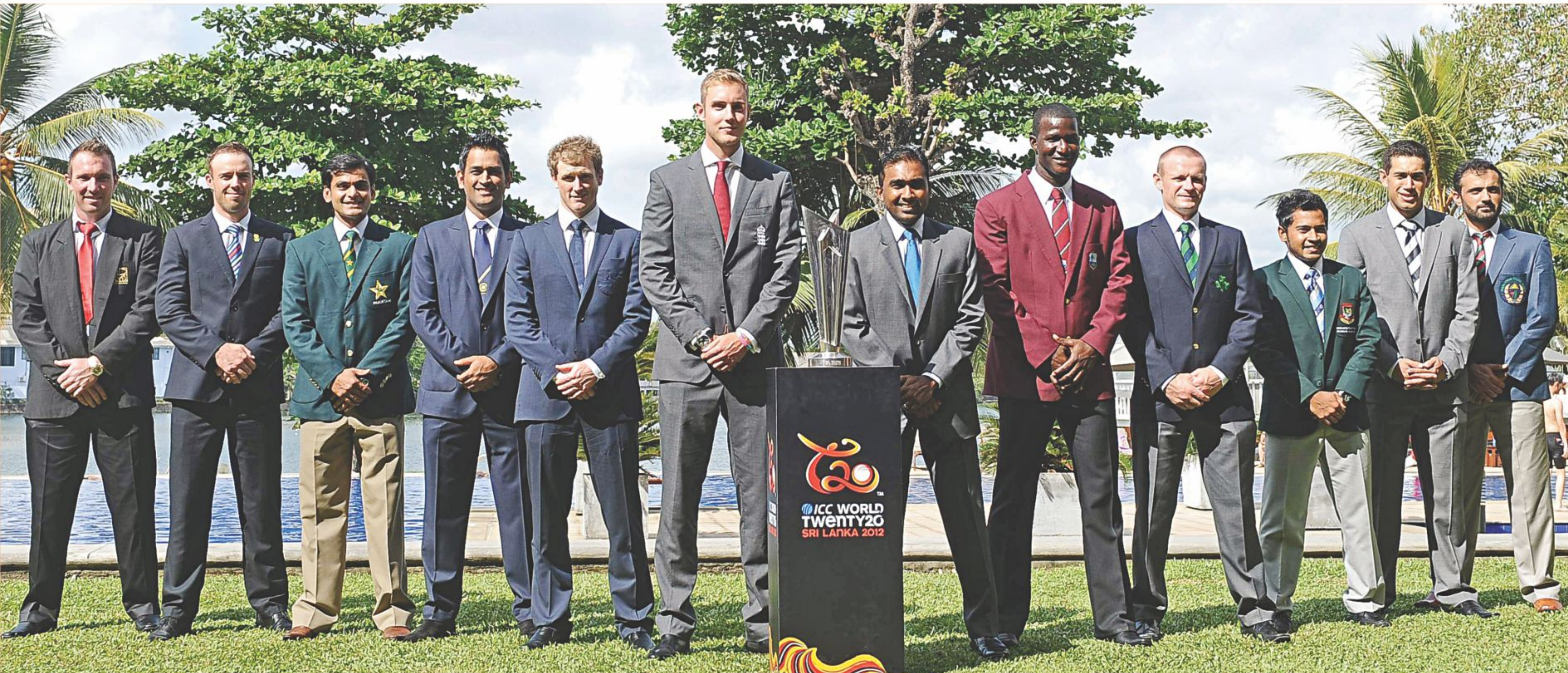
Bangladesh skipper Mushfiqur Rahim (3rd from R) poses for a photograph with the eleven other captains in front of the World T20 trophy, which all of them will be fighting for come September 18, in Colombo yesterday.