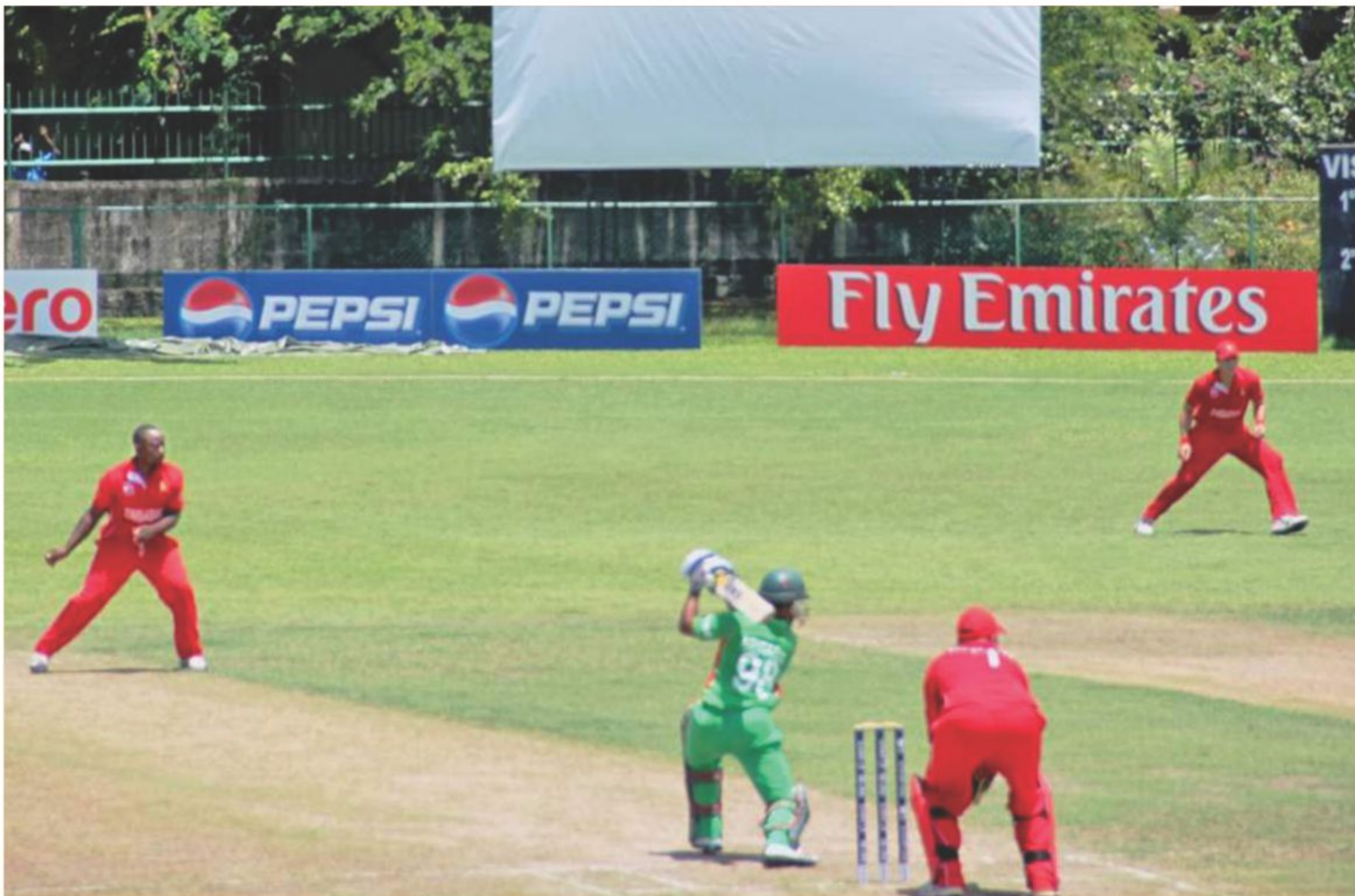
Bangladesh opener Mohammad Ashraful strikes the ball through the covers during the World T20 warm-up encounter against Zimbabwe at Colts Cricket Club Ground in Colombo yesterday.