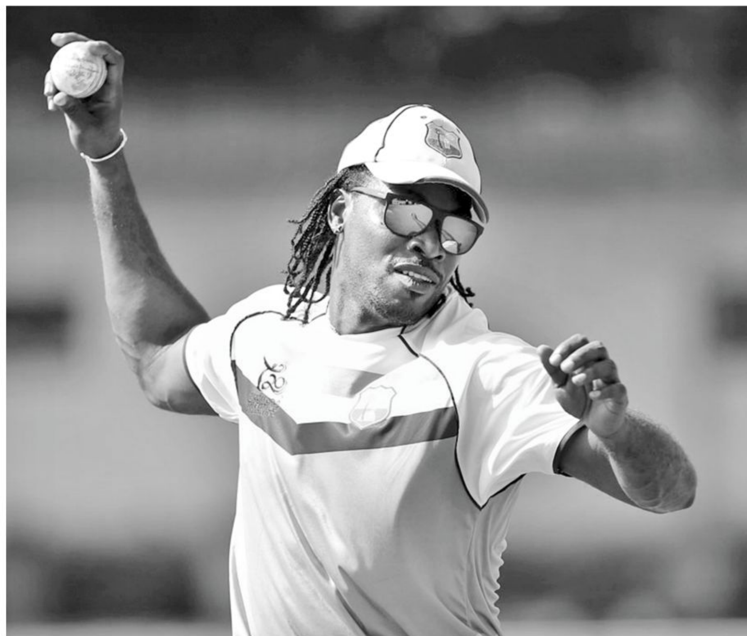
TAKING AIM: Big-hitting West Indies batsman Chris Gayle, shown here throwing a ball during the team's fielding drill in Colombo yesterday, will be taking aim at the world's bowlers when the World T20 gets underway in Sri Lanka from September 18.

An area of concern could be that star all-rounder Shakib Al Hasan is still recovering from an injury, but Mushfiqur is not too worried and believed that he will be fit. "He has a bit of a niggle but he will rest enough and be ready to go when the tournament starts," informed Mushfiqur.