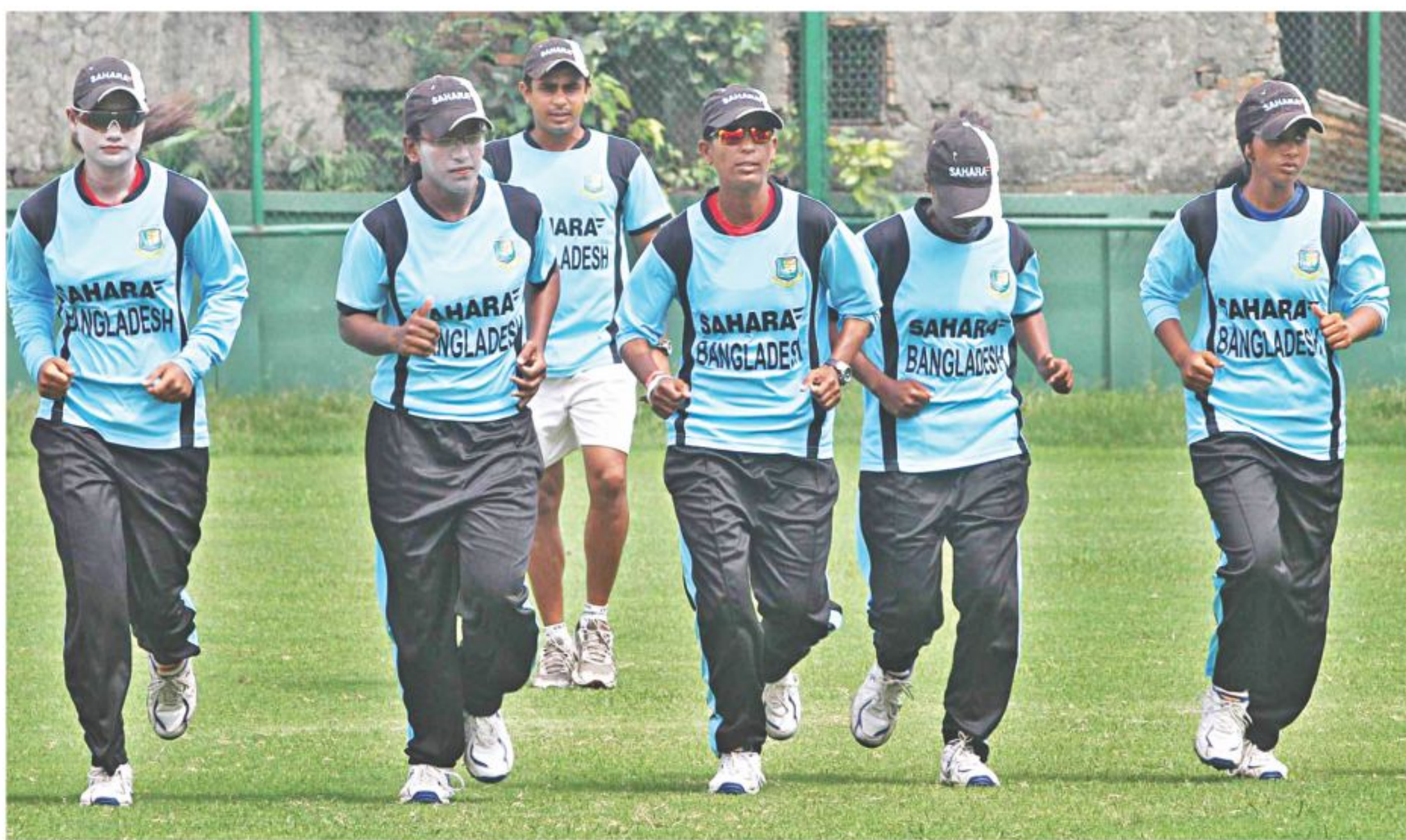
Players of the Bangladesh women's cricket team jog before a practice session at the Academy Ground in Mirpur yesterday, ahead of today's third and deciding T20I against the visiting South Africa.