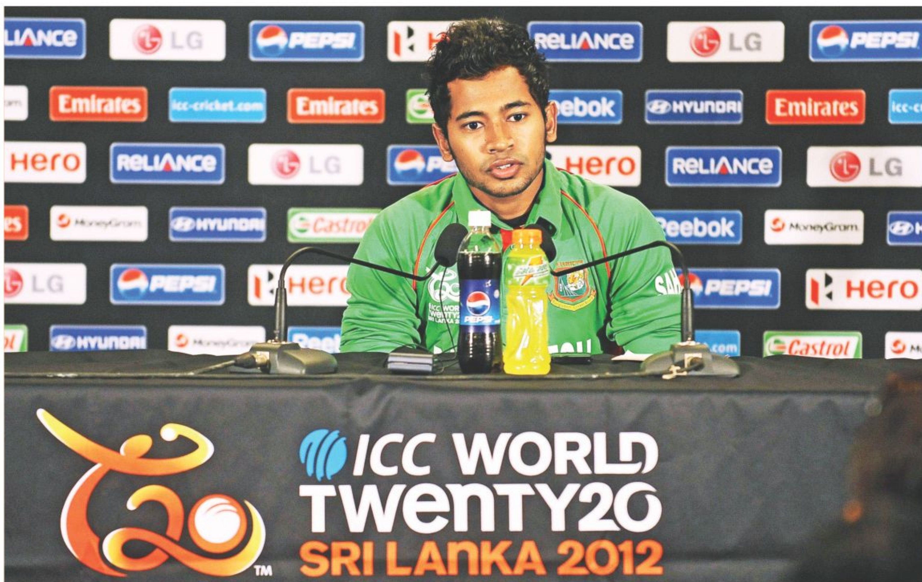
Bangladesh captain Mushfiqur Rahim speaks during a press conference in Colombo yesterday, ahead of the ICC World T20 which begins in Sri Lanka on September 18.