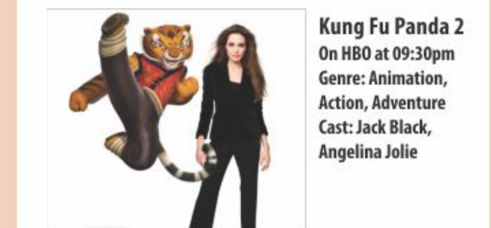
Kung Fu Panda 2 On HBO at 9:30pm