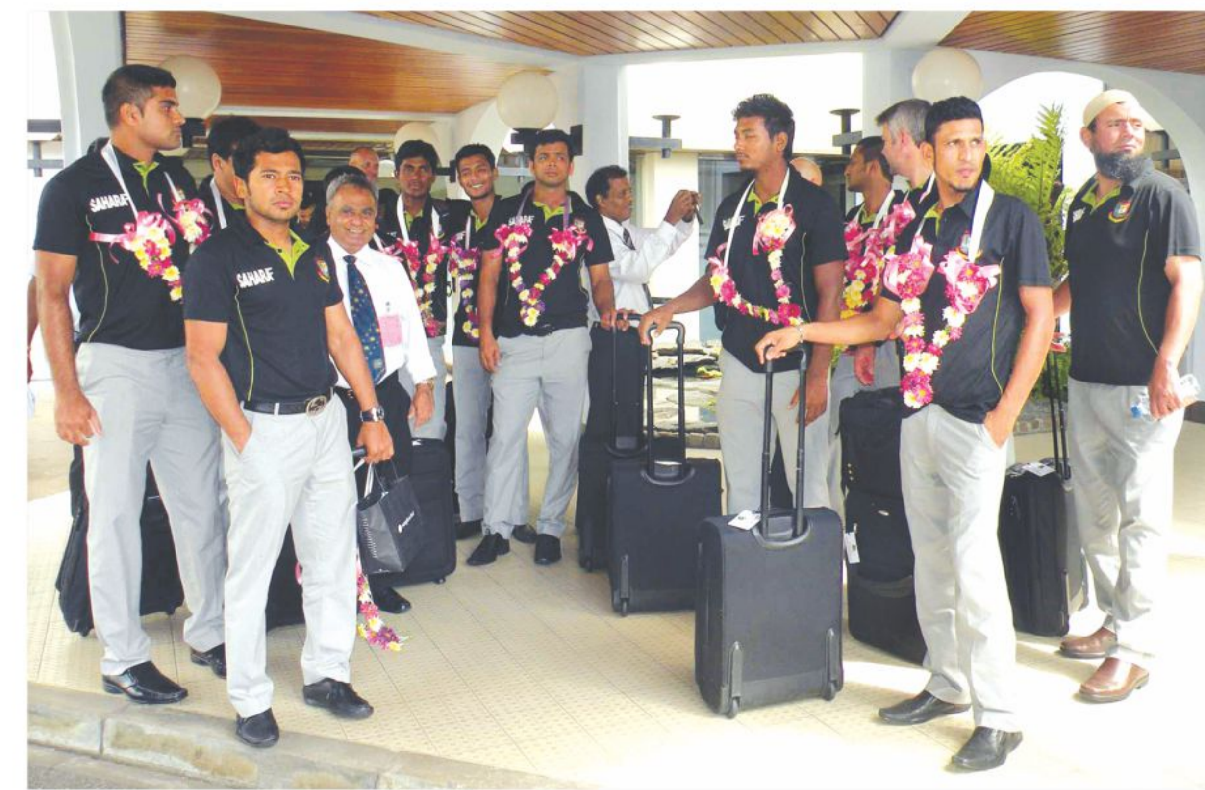
Bangladesh captain Mushfiqur Rahim (2nd from L) stands with his team, who will take on New Zealand in their first match of the World T20 on September 21, outside the Bandaranaika International Airport in Katunayake yesterday.