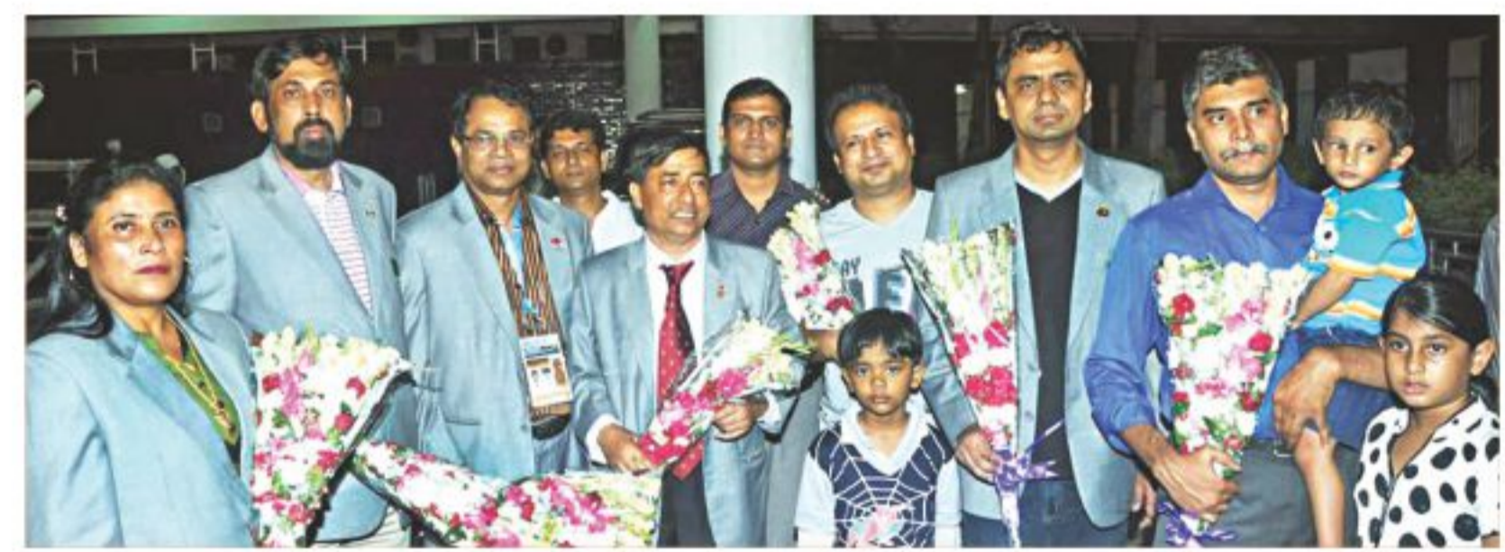
Players and officials of the chess teams were given a warm reception at the Hazrat Shahjalal International Airport yesterday.

"We are all satisfied with the collective performance which let us achieve the best ever result in the Olympiad. But this team has the ability to produce even better results," said Bangladesh