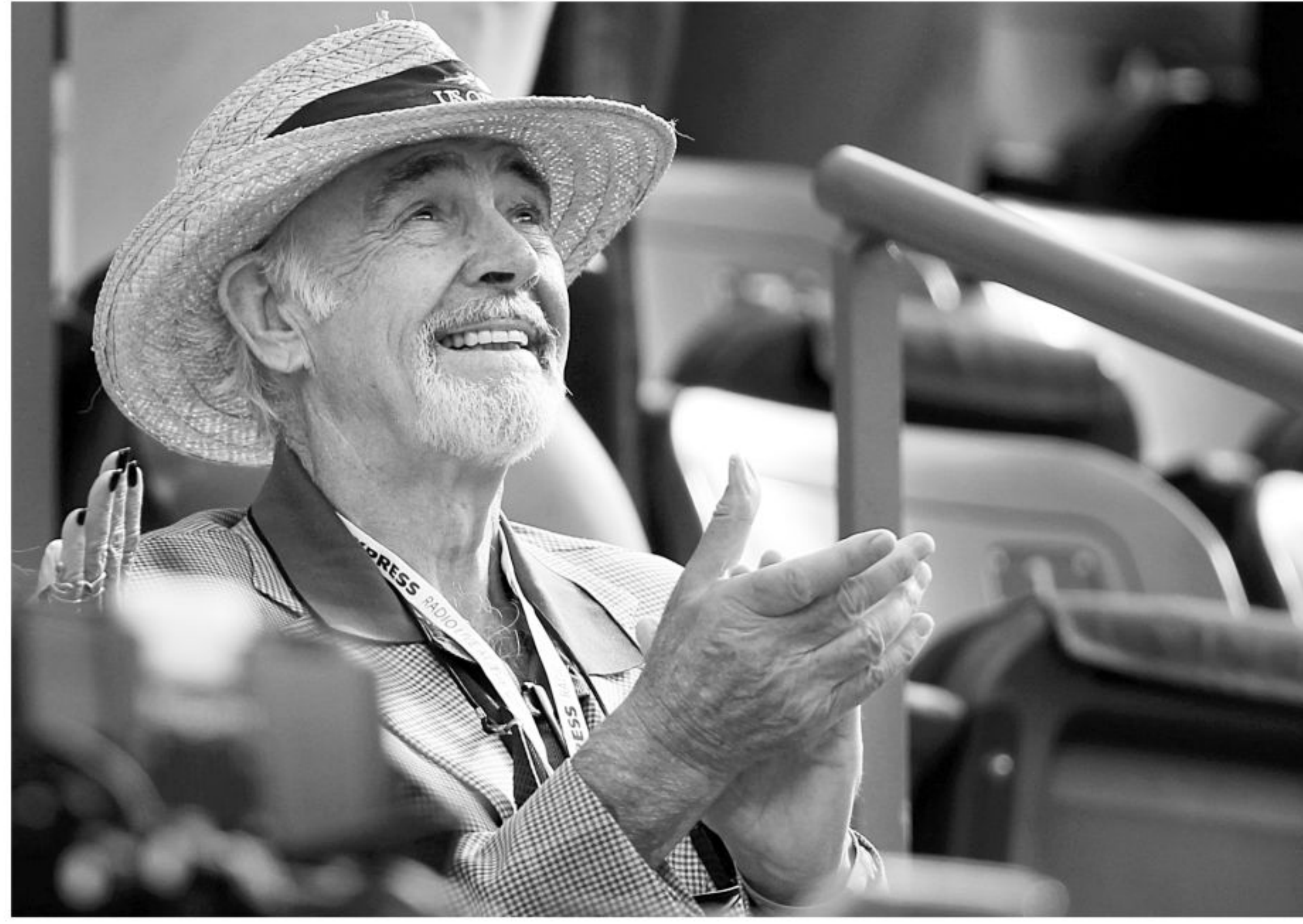
A cheerful Sean Connery awaits the start of the US Open final between his countryman Andy Murray of Scotland and Serbia's Novak Djokovic at Flushing Meadows on Monday. The James Bond star cheered Murray on to his first Grand Slam win.

England were 29 for two off 4.1 overs when the umpires, aware that five balls were required to force a result under the Duckworth-Lewis method, called the players off the field.