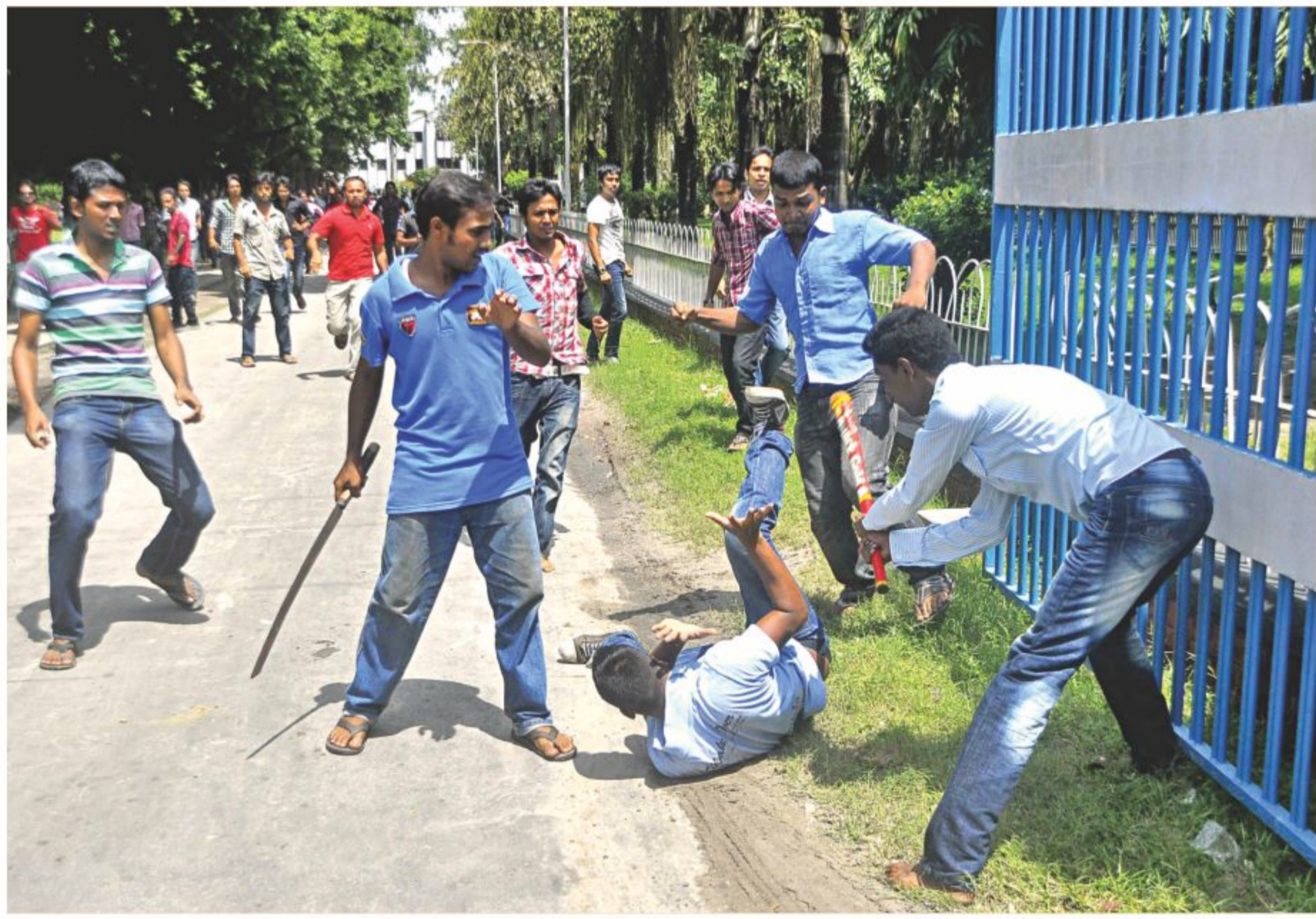
Activists of Bangladesh Chhatra League, the student body associated with the ruling Awami League, beat up a member of Jatiyatabadi Chhatra Dal, pro-BNP student organisation, at Rajshahi University yesterday. Story on page 19.