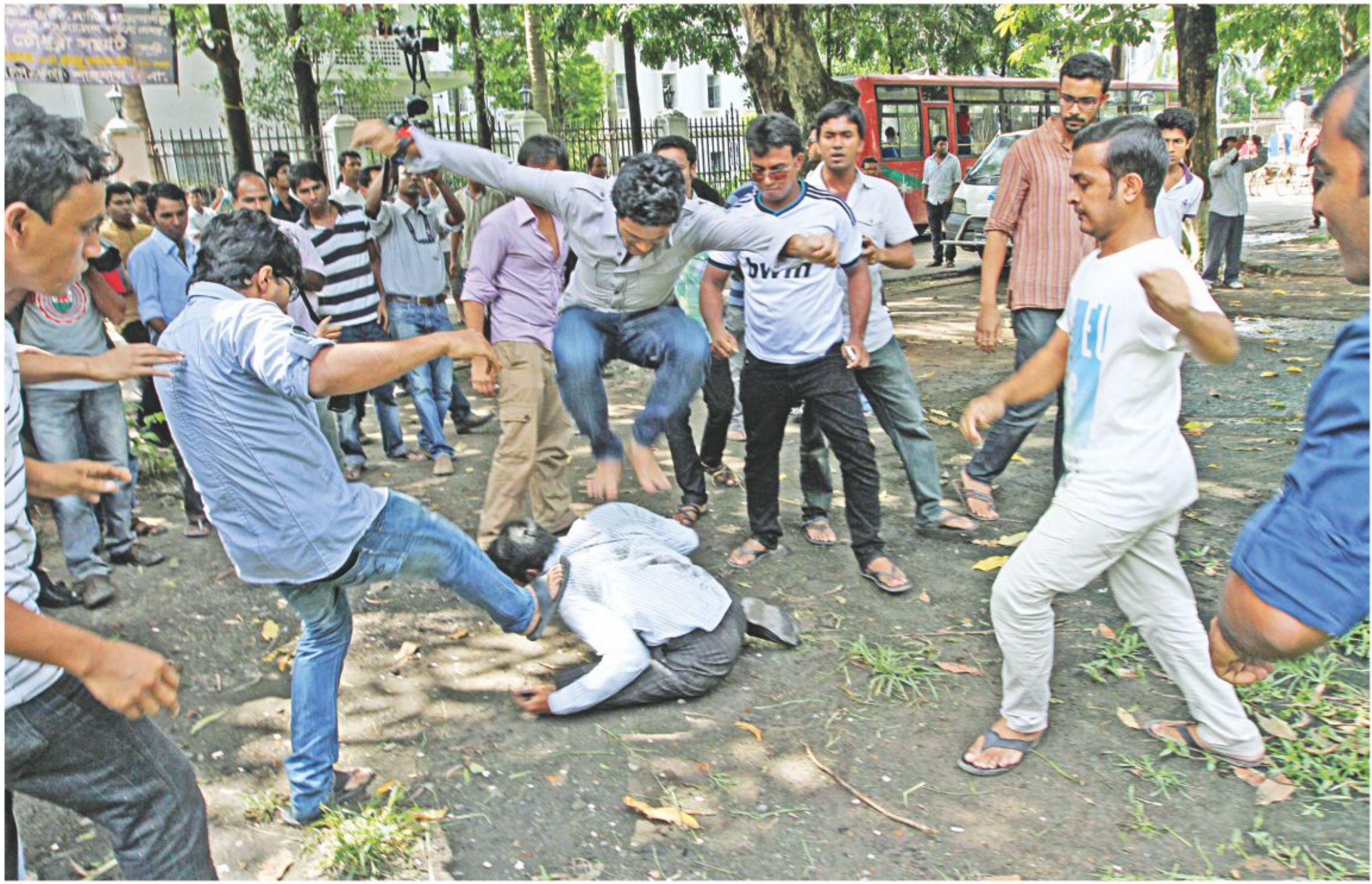
Pro-Awami League Bangladesh Chhatra League activists stomp on and kick a pro-BNP Jatiyatabadi Chhatra Dal activist in front of the Institute of Education and Research in Dhaka University yesterday. JCD activists were waiting to accompany their new central and DU unit leaders to a call on the vice-chancellor when the attack took place. (Story on Page 1)