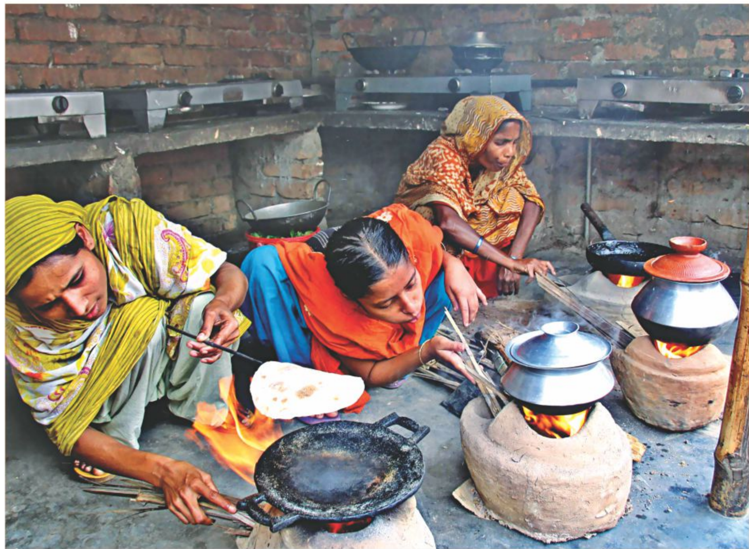
These women at Moghbazar in the capital use clay burners to cook as the area has been suffering from a shortage of gas supply for a week. They do not get gas from 6:00am until 8:00pm. And even if they get the supply at times, it remains insufficient for cooking.