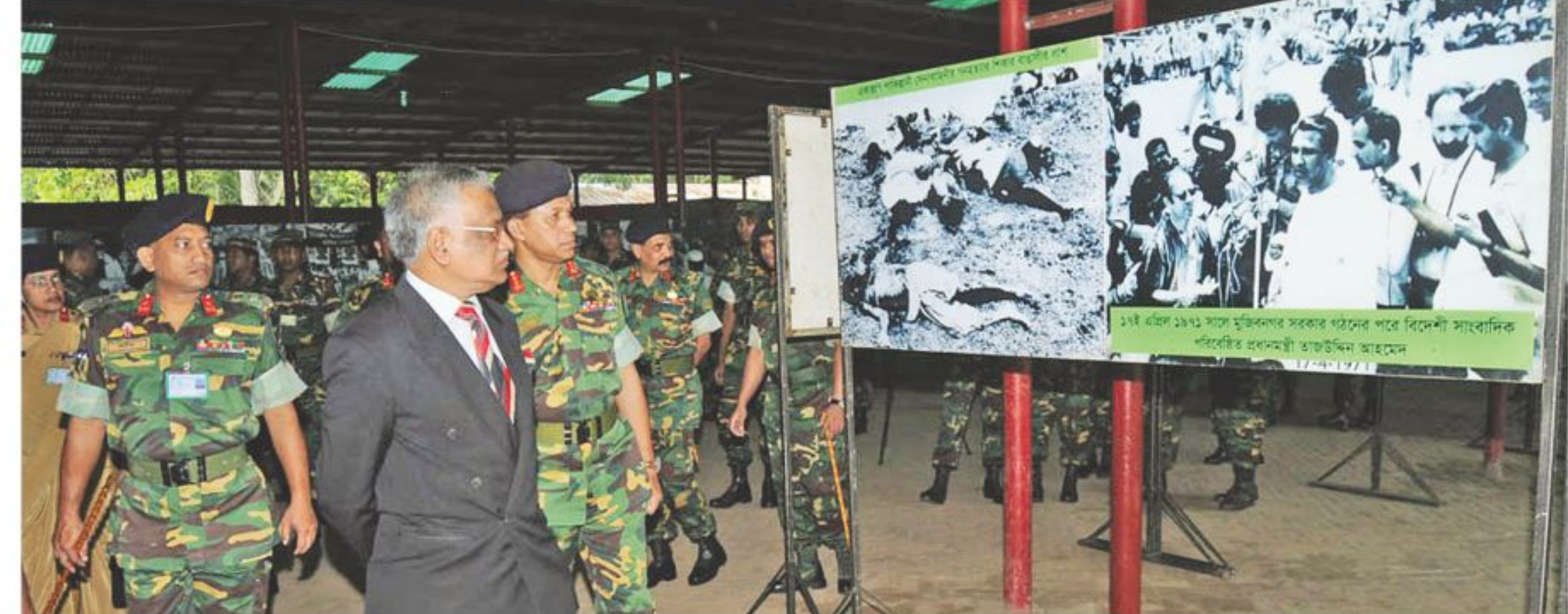
The chief guest at the photo exhibition.