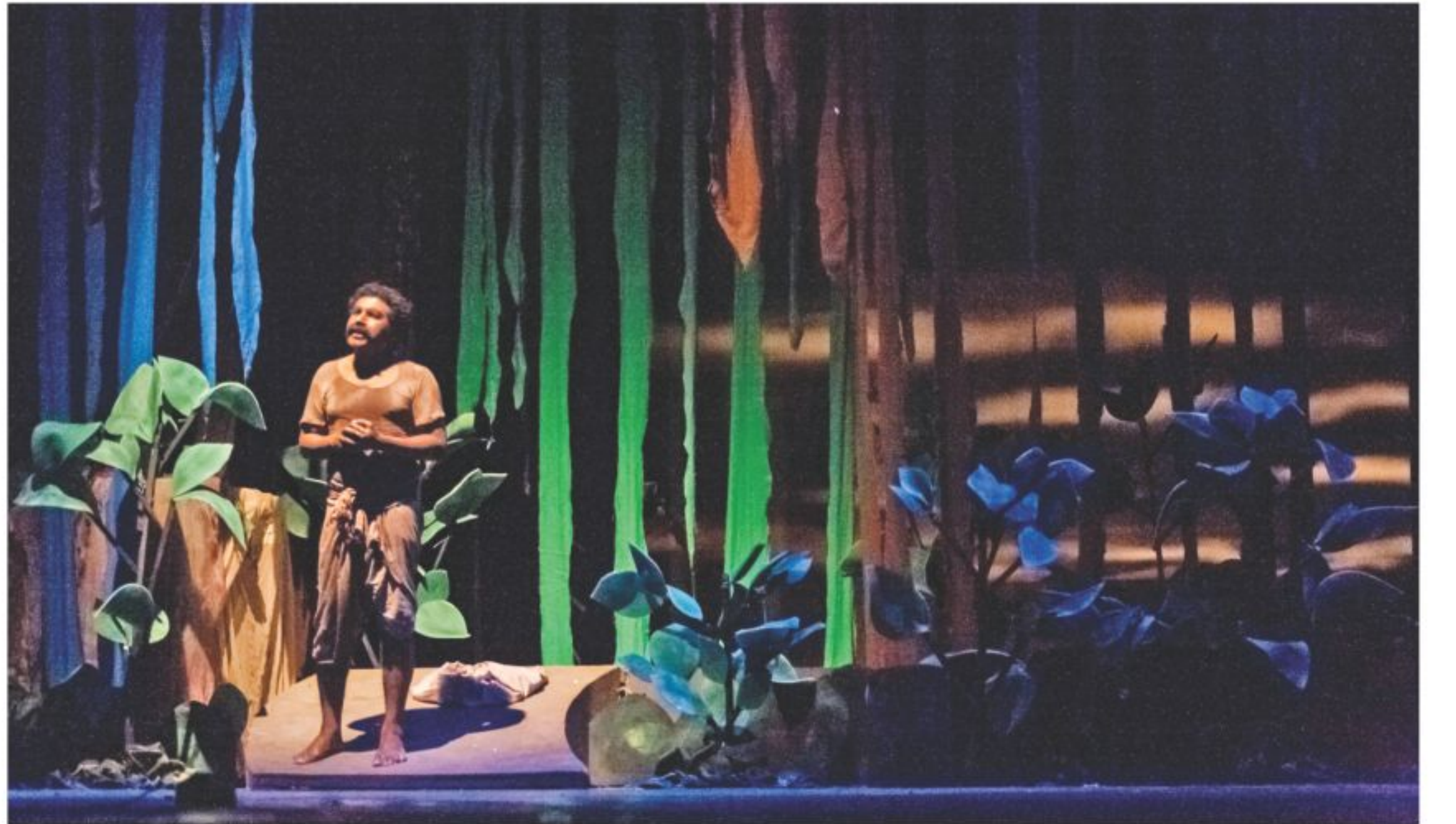
The apparently simple narrative comes alive with brilliant acting, striking sequences and remarkable stage designing.