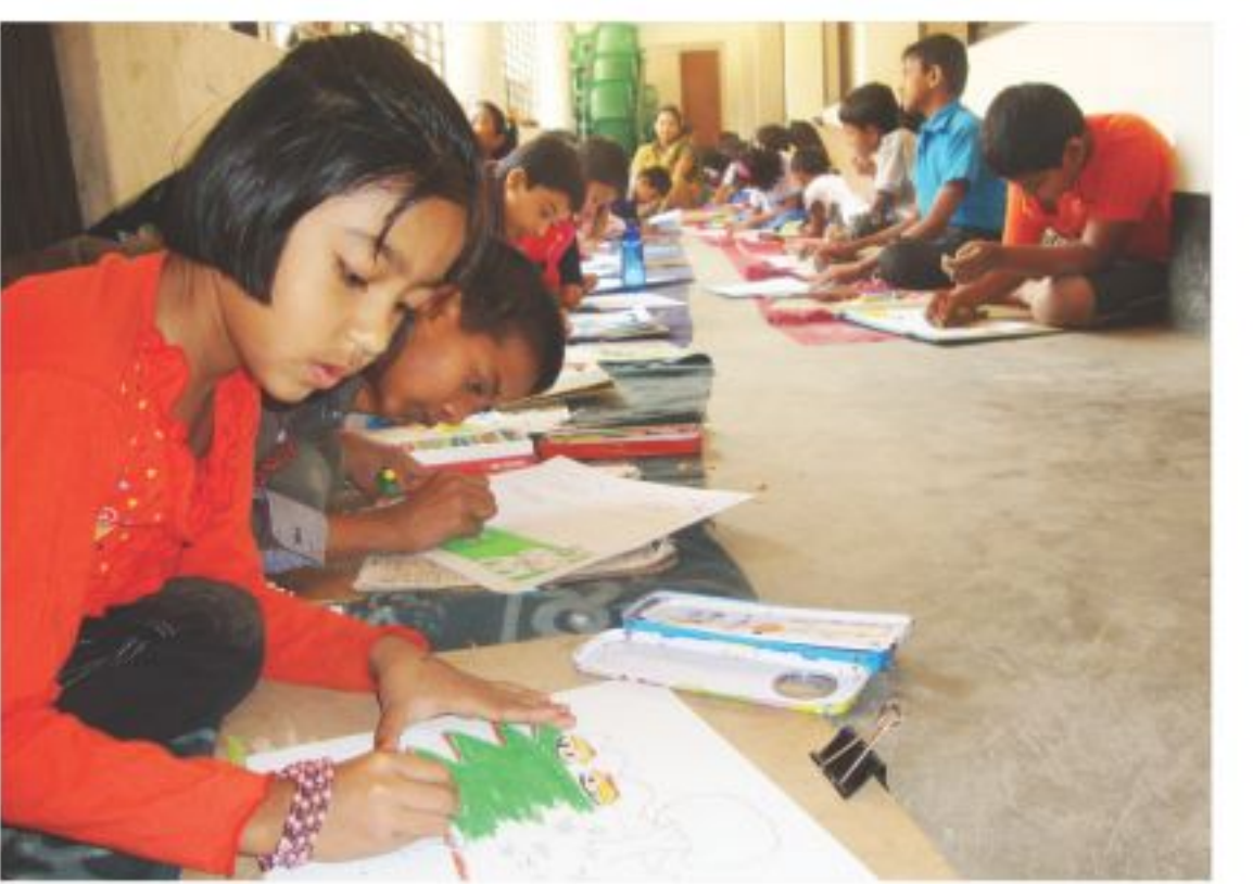
Children participate at the art competition.