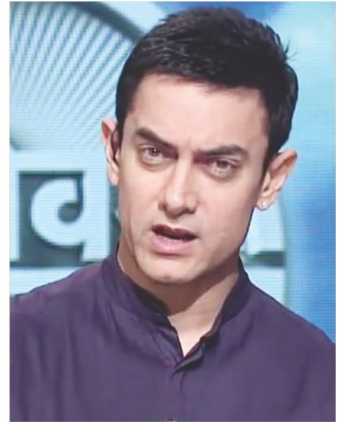
This new avatar as a host outshines Khan's celebrity superstar status arrived at through numerous successful movies.