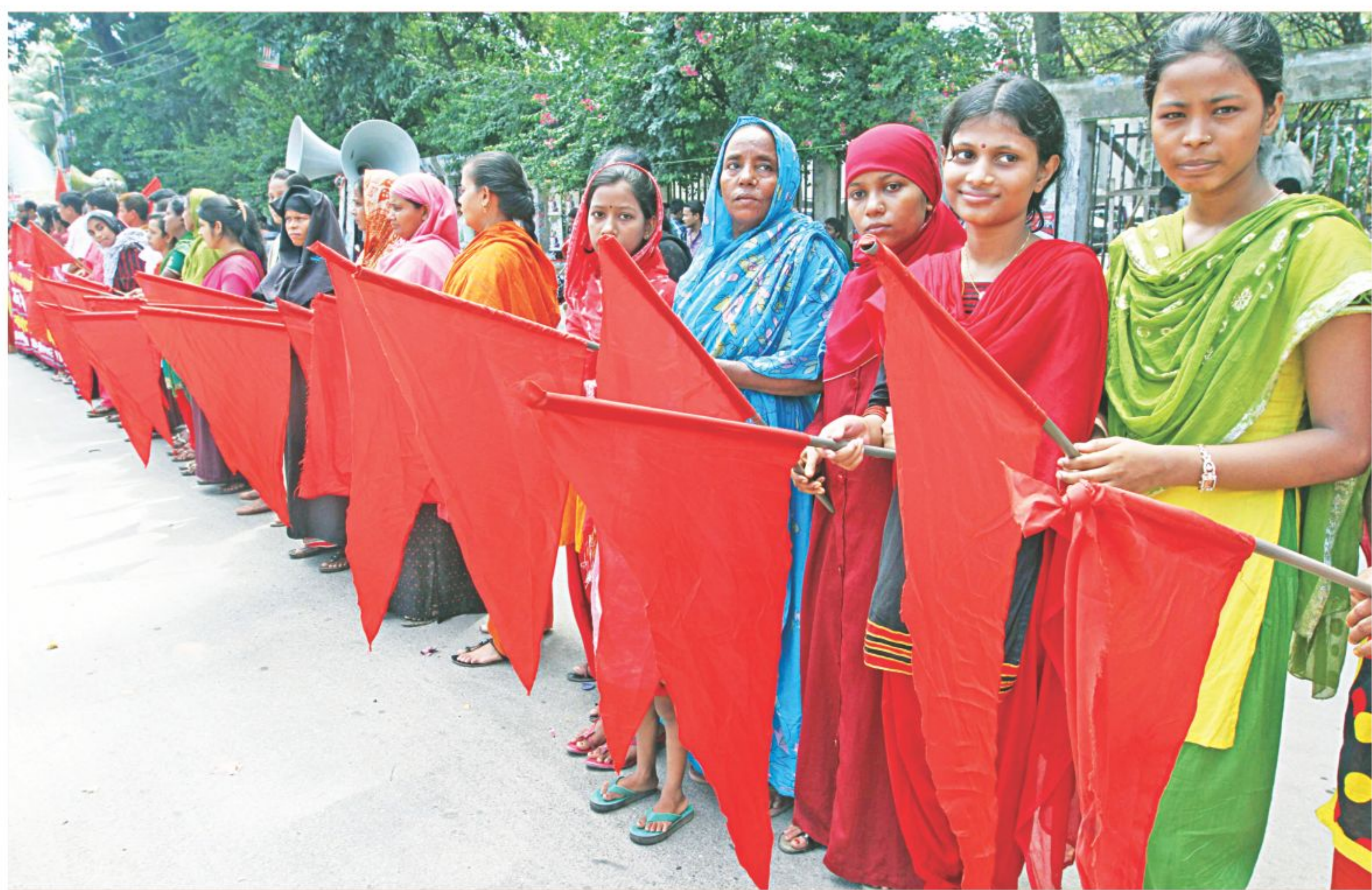
Bangladesh Garments Sramik Oikya Parishad forms a human chain in front of Jatiya Press Club in the capital yesterday demanding removal of the provisions, which go against the interests of the workers, from The Bangladesh Labour Act, 2006.