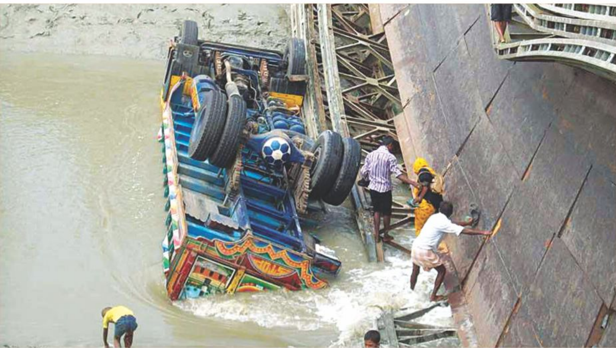
The Katafarhi bailey bridge at Pekua upazila of Cox's Bazar collapsed with a stone-laden truck yesterday morning halting traffic in both sides of the Boroitoli-Mognama road.