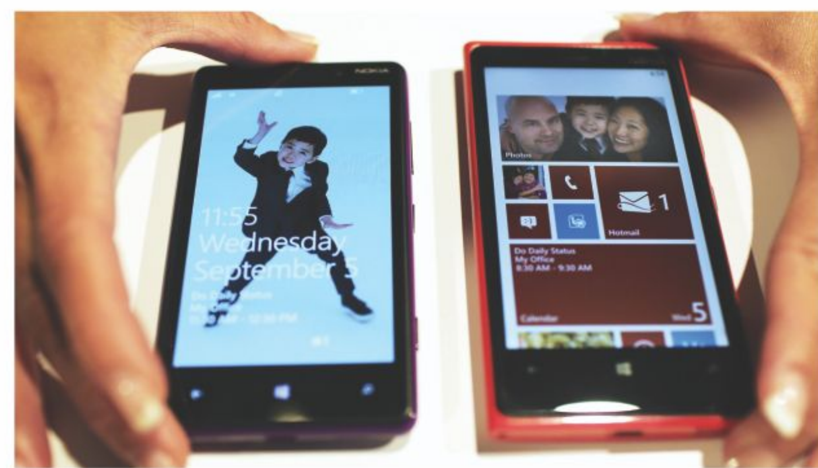
The new Nokia 820 and (L) Lumia 920 Windows smartphones.

The event also unveiled a Lumia 820, described as "a stylish, mid-range smartphone that delivers high-end performance in a compact package" with interchangeable shells, including one in purple.