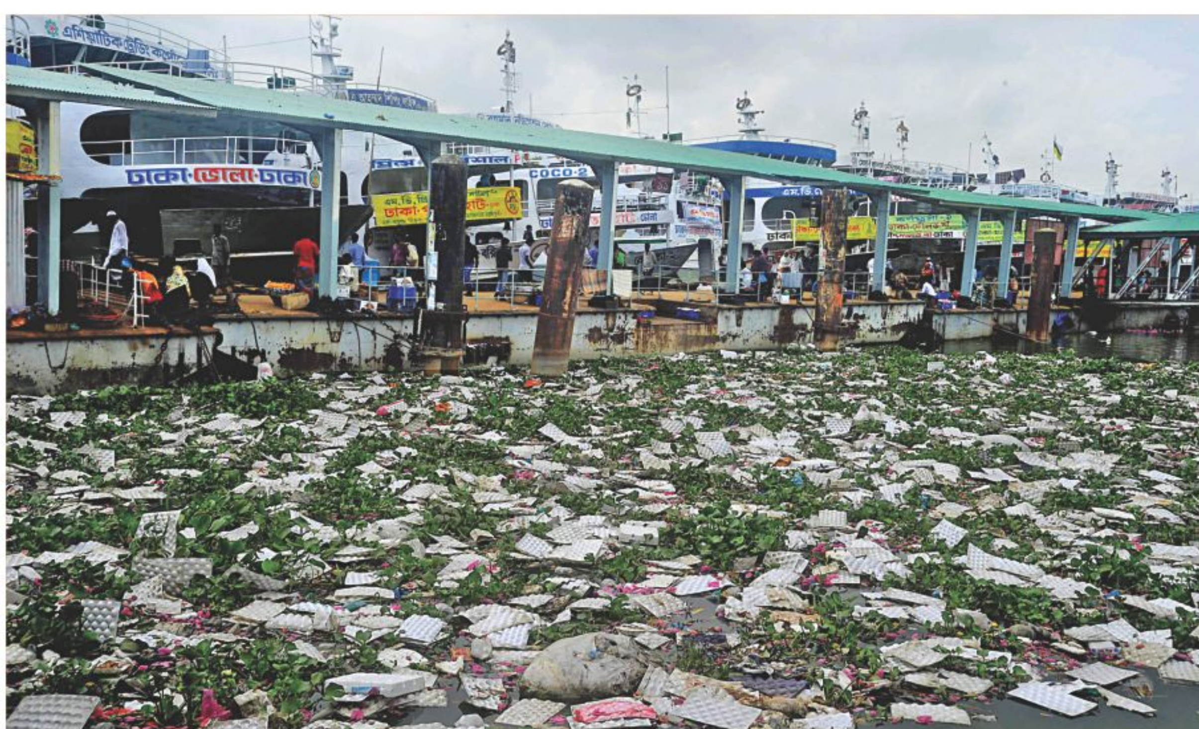
Waste from floating food shops at Sadarghat Launch Terminal is dumped into the river Buriganga every day. The river, considered the lifeline of the capital, is gradually dying due to such reckless activities. The photo was taken recently.