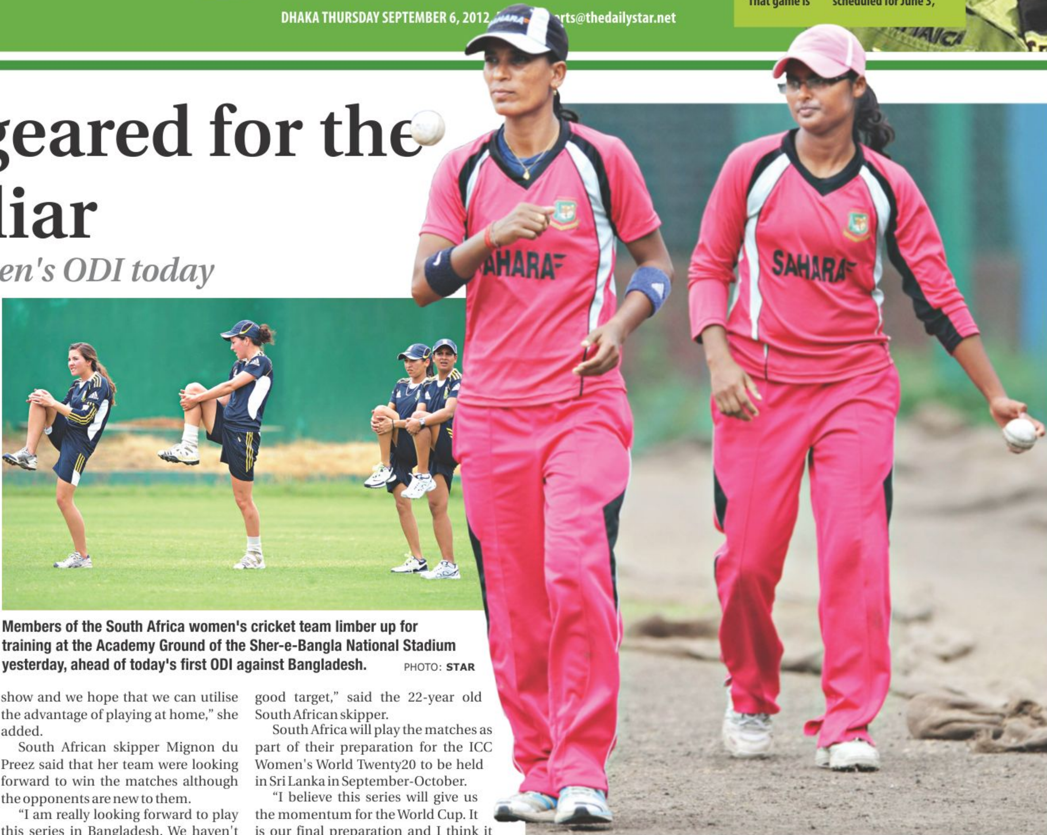
Members of the South Africa women's cricket team limber up for training at the Academy Ground of the Sher-e-Bangla National Stadium yesterday, ahead of today's first ODI against Bangladesh.