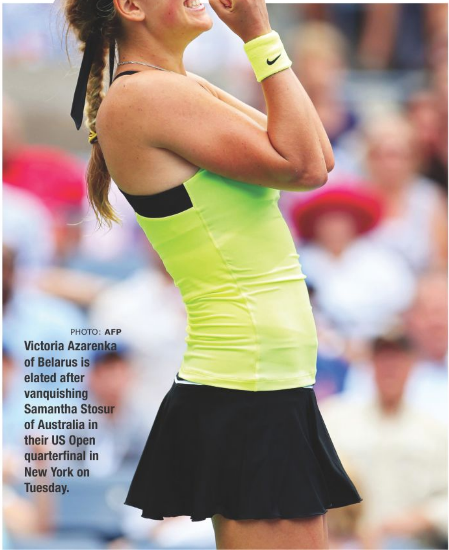
Victoria Azarenka of Belarus is elated after vanquishing Samantha Stosur of Australia in their US Open quarterfinal in New York on Tuesday.

"I don't want to stop yet," Azarenka said. Sharapova was forced to stop, first by rain and then by US officials, who ordered the match to be suspended.