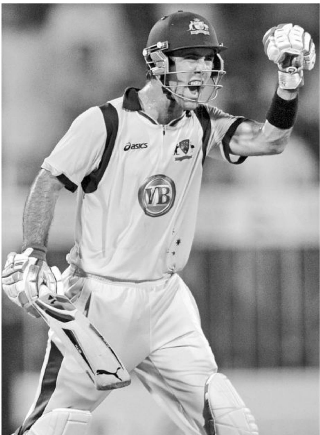
Australia's Glenn Maxwell pumps his fist after scoring the winning runs against Pakistan in the third and deciding one-dayer at the Sharjah Cricket Stadium on Monday night.

Australia got off to a rapid start with David Hussey putting on 44 by the ninth over with David Warner (21), both taking the attack to the Pakistanis from the outset. David Hussey hit