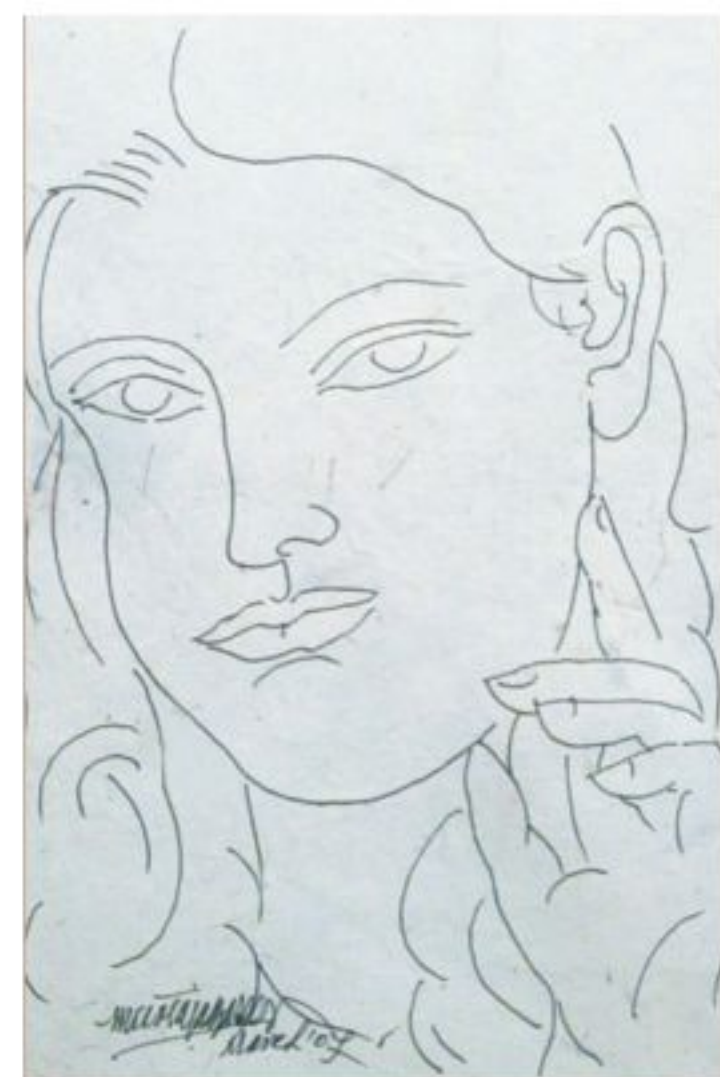
A drawing by Murtaja Baseer.