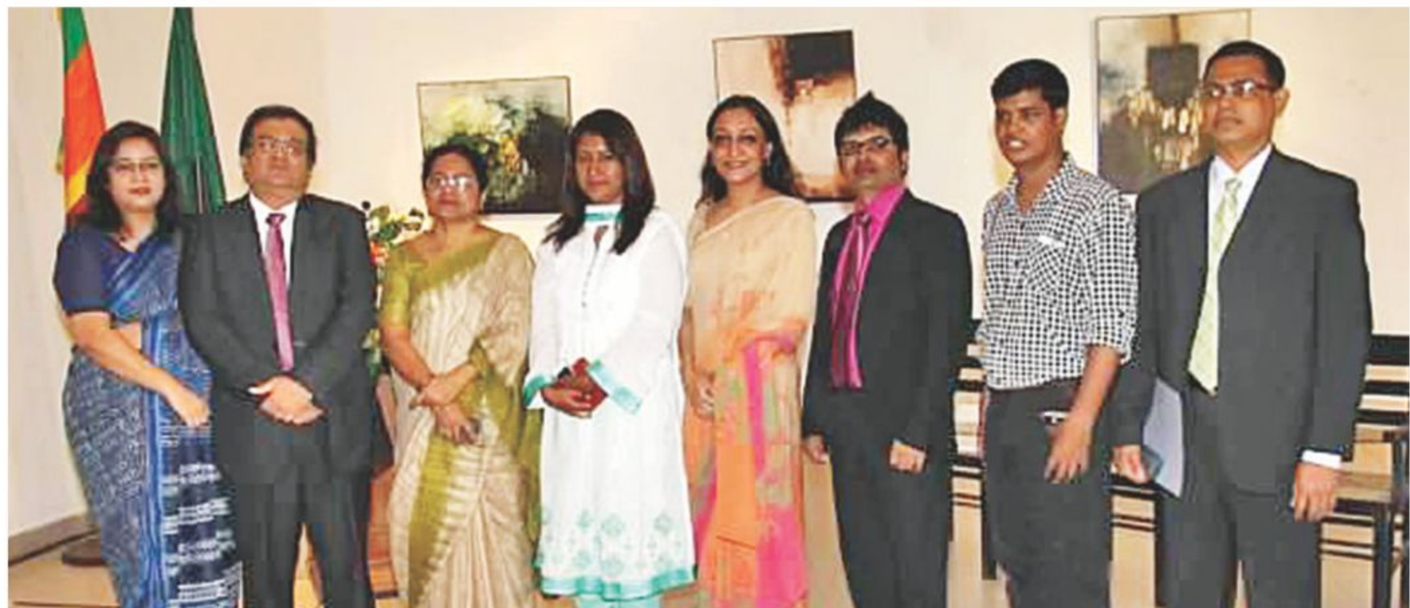
Bangladeshi artists with dignitaries at the inauguration of the exhibition.

"Once, the traditional boat race used to be an annual fixture in the mighty river Padma during the rainy season. The river has lost its early heritage but we are losing our tradition too. To keep our heritage alive we have organised festival for the people who live beside the mighty river Padma," said Sayeed, also the organiser of the festival.