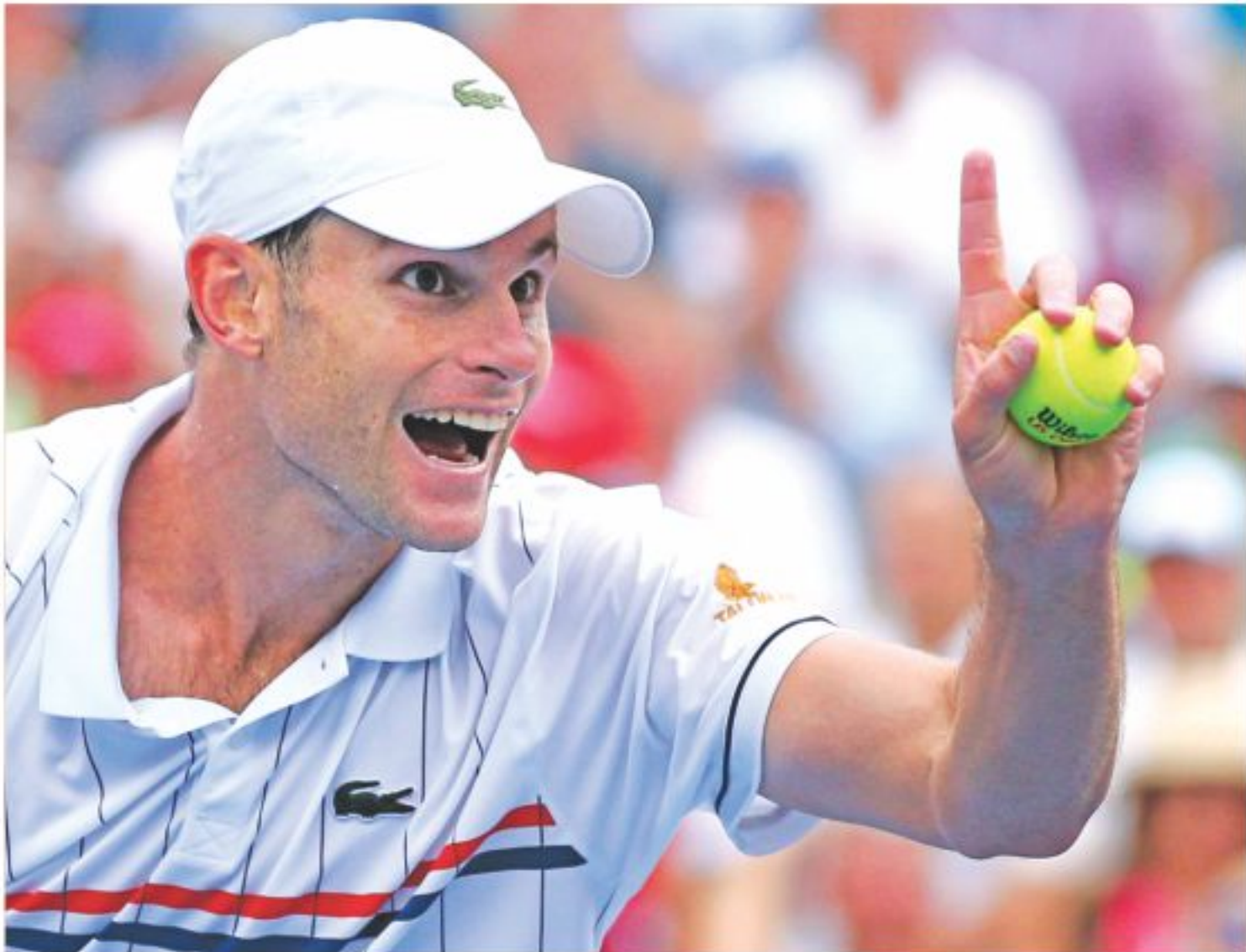
Russian sensation Maria Sharapova (R) and former world number one Andy Roddick of the USA celebrate their respective victories in the US Open at Flushing Meadows on Sunday. Sharapova reached the quarterfinals while Roddick, who announced he would hang up his racket after the tournament, moved to the fourth round.

Bangladesh has been placed in Group D along with New Zealand and Pakistan in the ICC World Twenty20. The Tigers will take on New Zealand on September 21 before meeting Pakistan on September 25. Both matches will be played at the Pallekele International Cricket Stadium.