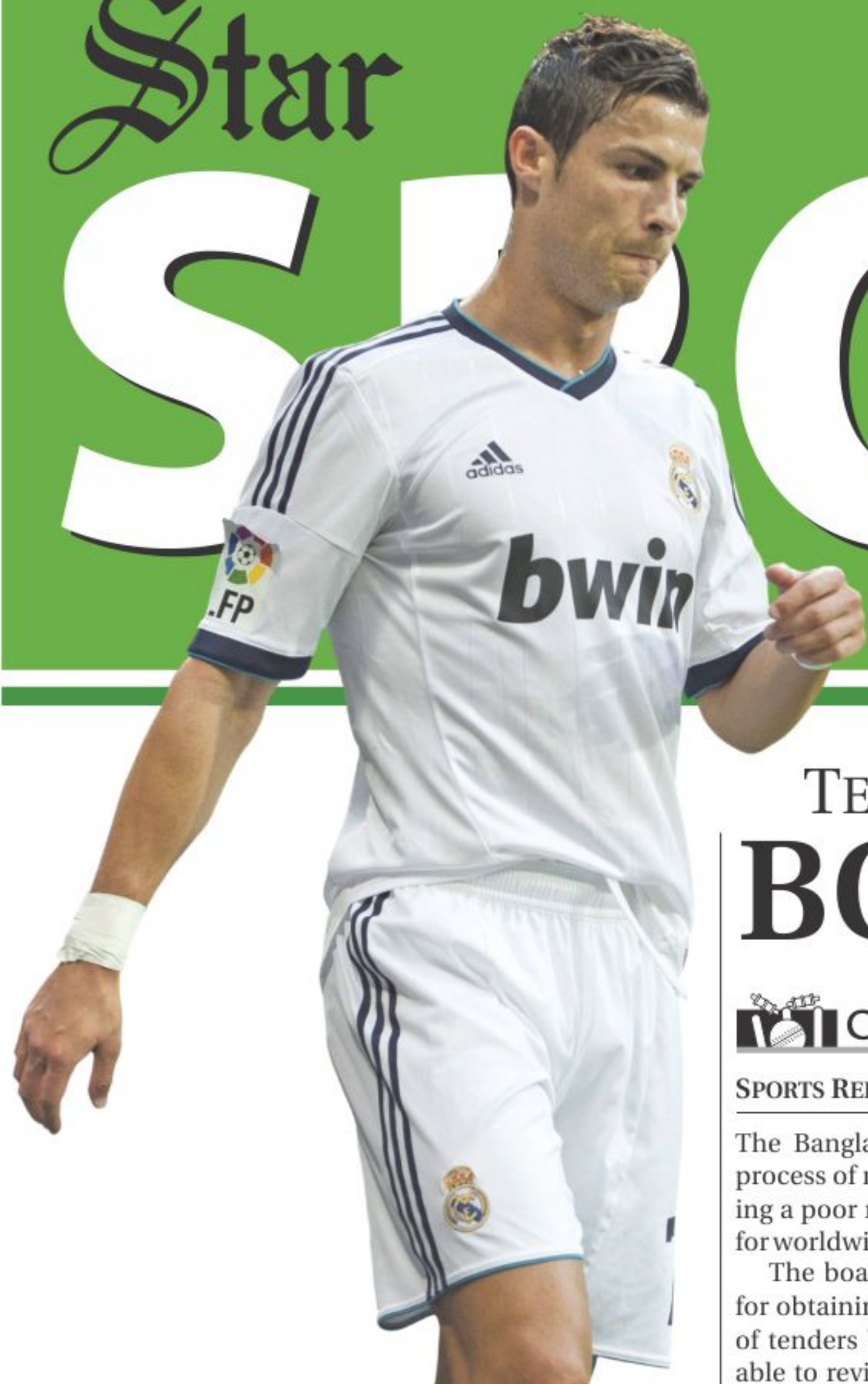
Real Madrid superstar Cristiano Ronaldo refrains from celebration after opening the scoring against Granada in their La Liga encounter at the Santiago Bernabeu on Sunday. The Portuguese striker later revealed to reporters that he did not celebrate the two goals because he was unhappy at the club.