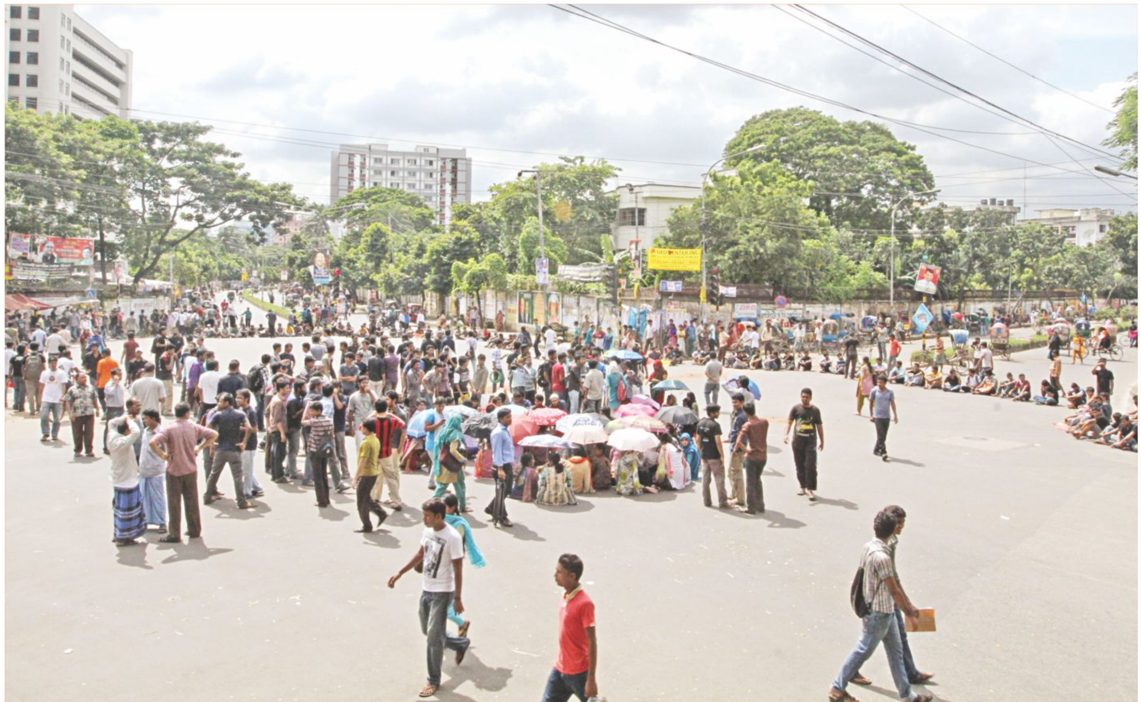
Students of Bangladesh University of Engineering and Technology (Buet), demanding resignation of the vice-chancellor and the pro-vice chancellor, put up a blockade on the Palashi intersection in the capital yesterday. (Story on Page 1)