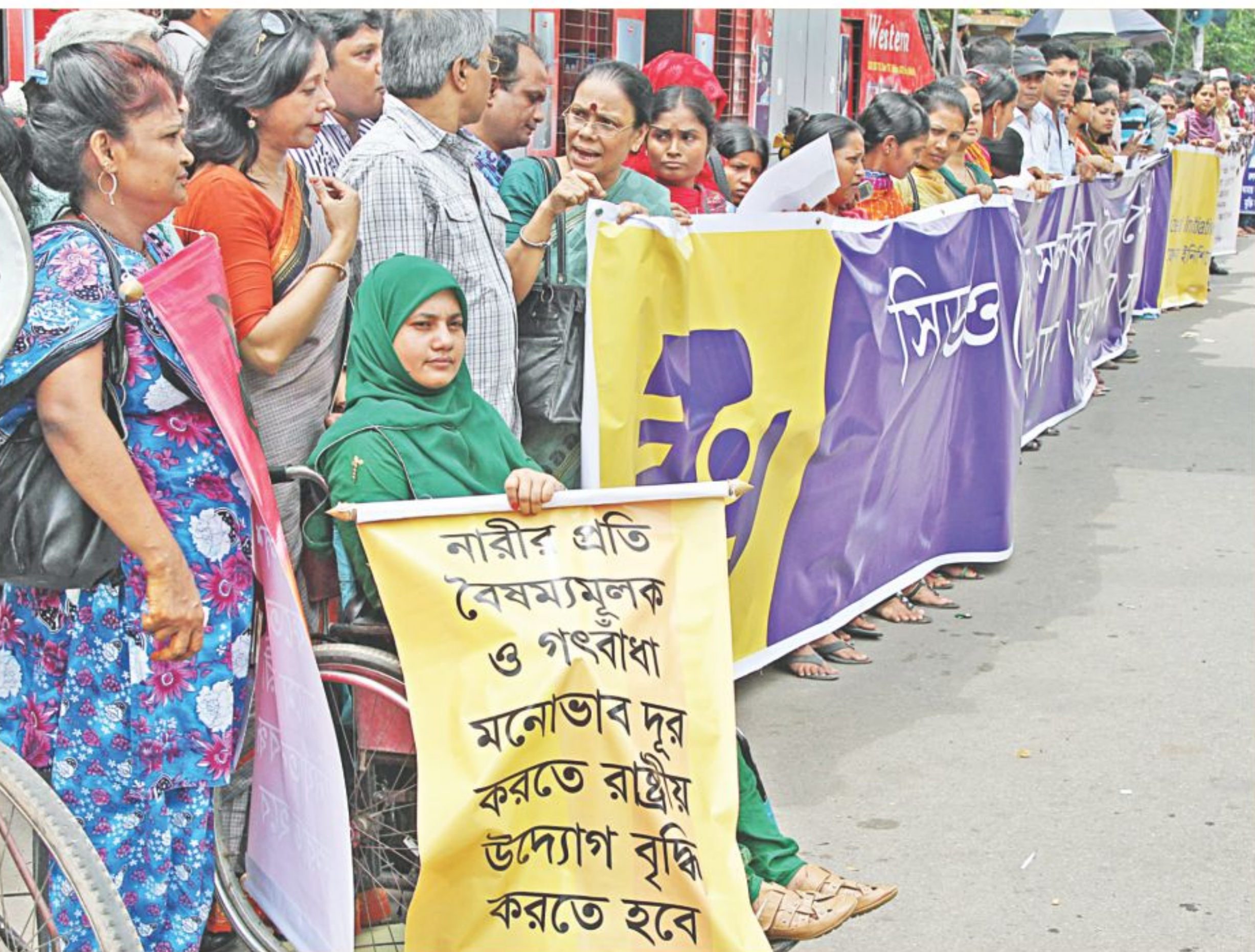
A platform of 42 human rights and development organisations forms a human chain in front of Jatiya Press Club in the capital to observe International CEDAW Day yesterday.