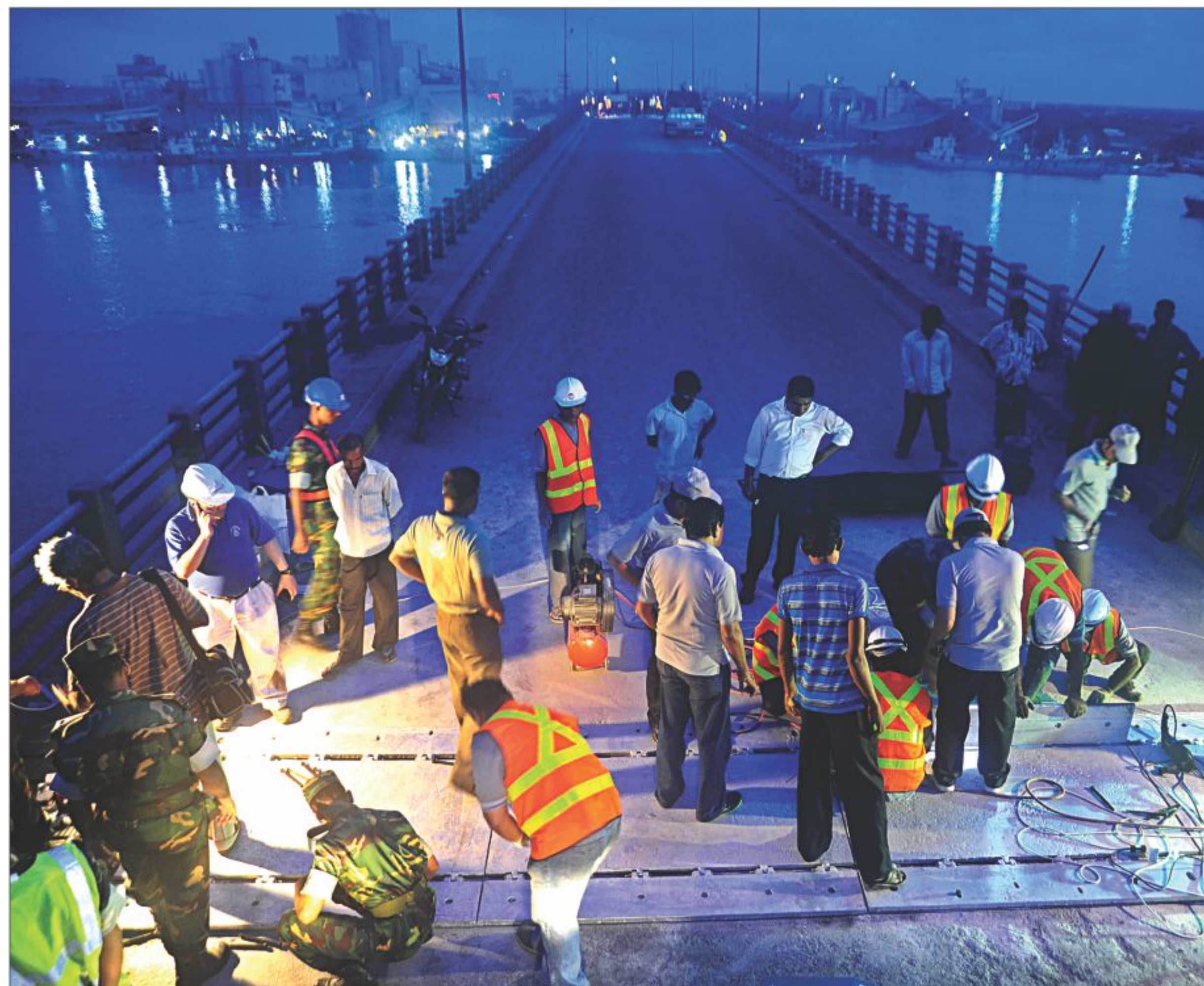
Temporary renovation of Meghna bridge is being carried out under the supervision of Bangladesh Army around 5:00am yesterday. Because of the work, traffic operation on the bridge will remain suspended for seven hours from 11:00pm every day till September 7. Story on page 2.