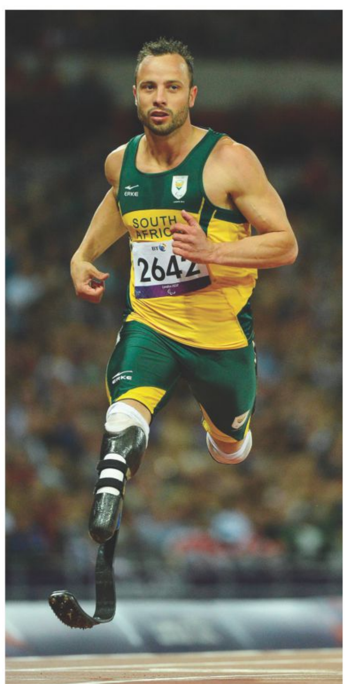
South Africa's double amputee sprinter Oscar Pistorius sets a new world record as he wins his men's 200m T44 classification heat in 21.30 seconds during the London 2012 Paralympic Games at the Olympic Stadium on Saturday.