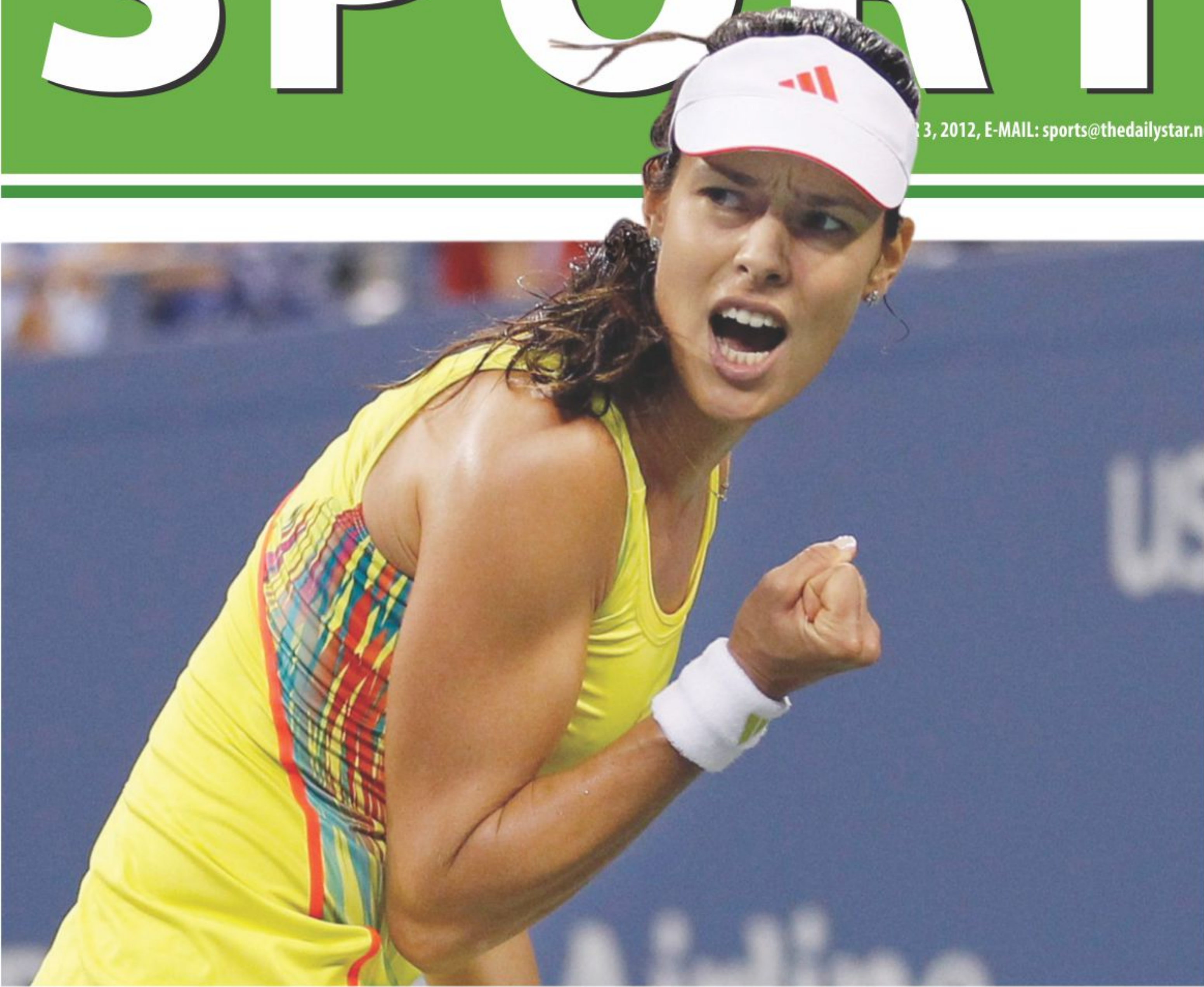
Serbian tennis player Ana Ivanovic is pumped up after winning a point during her US Open 3rd round win over Sloane Stephens of USA in New York on Saturday.