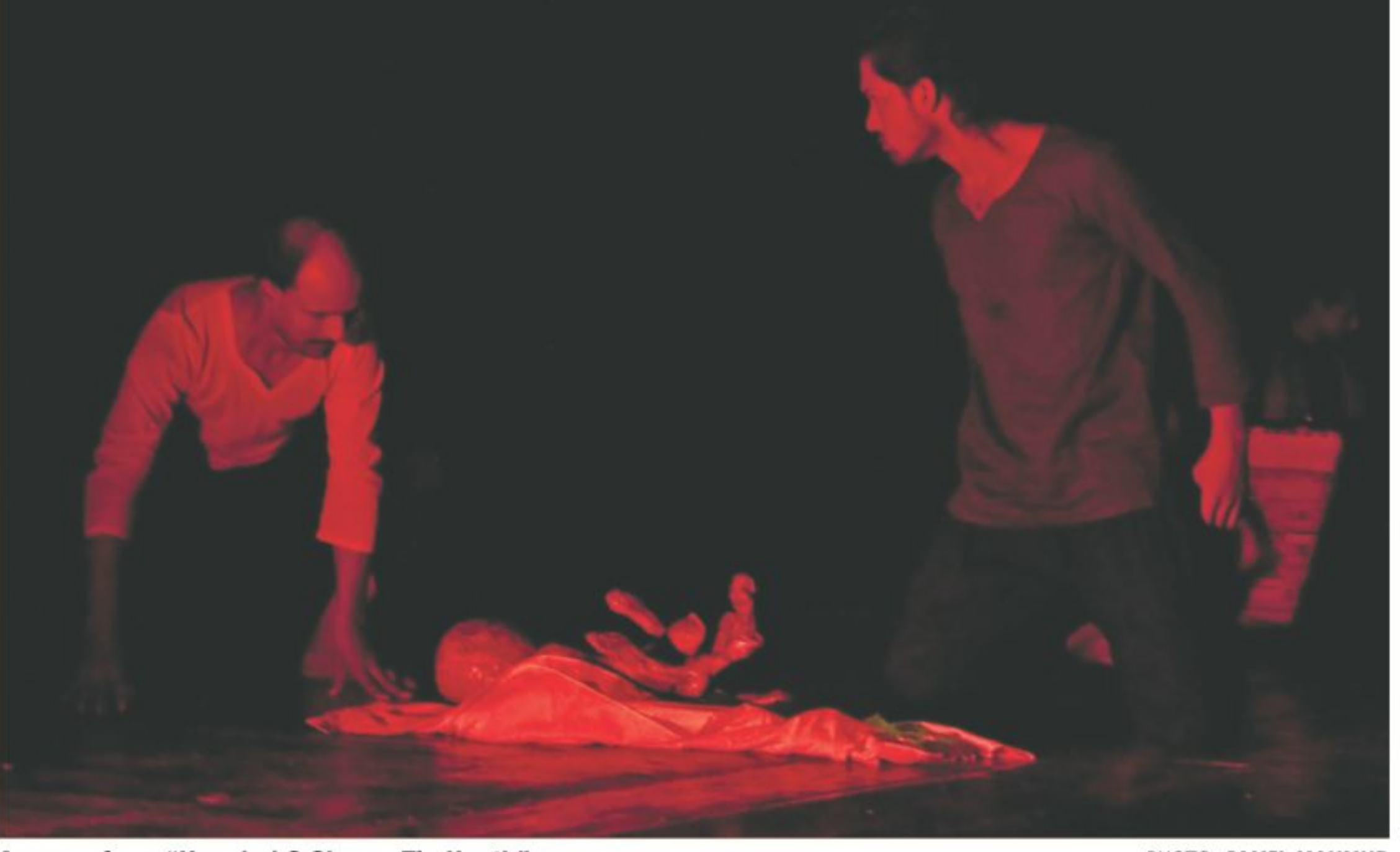
A scene from "Kongkal O Sharey Tin Haath".