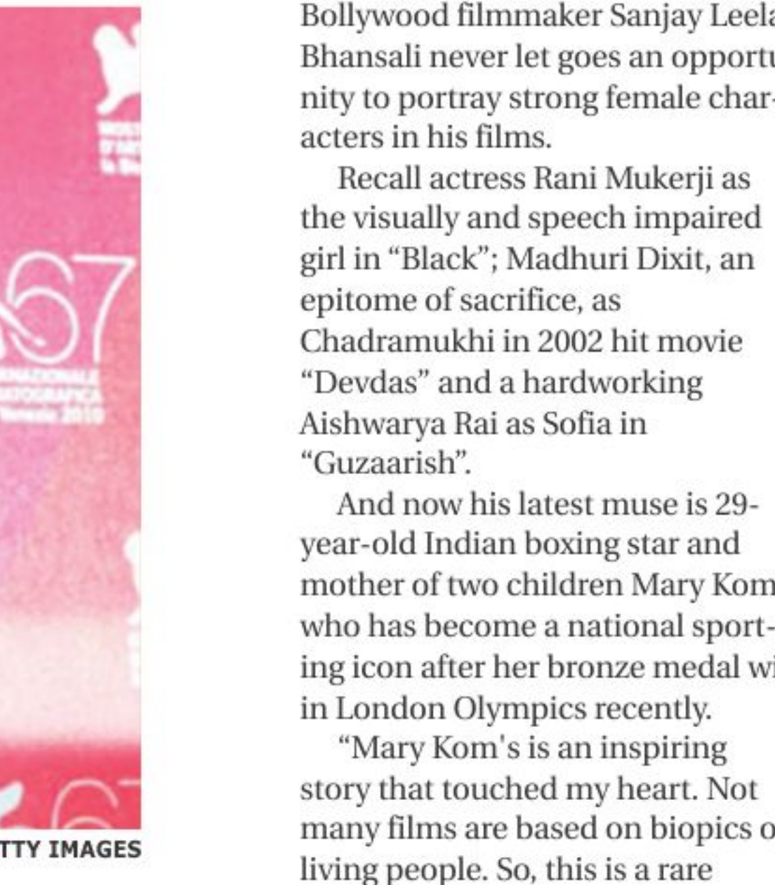
Sofia Coppola at the 2010 Venice film festival.