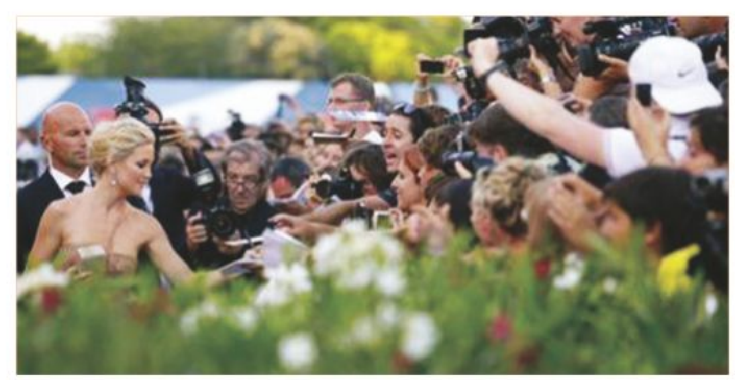
Kate Hudson signs autographs as she arrives for the red carpet of the movie "The Reluctant Fundamentalist".

Ahmed, who also starred in the controversial suicide bomber comedy "Four Lions", said he shared some of Changez's frustrations. "We are to some extent defined by the labels that are slung around our