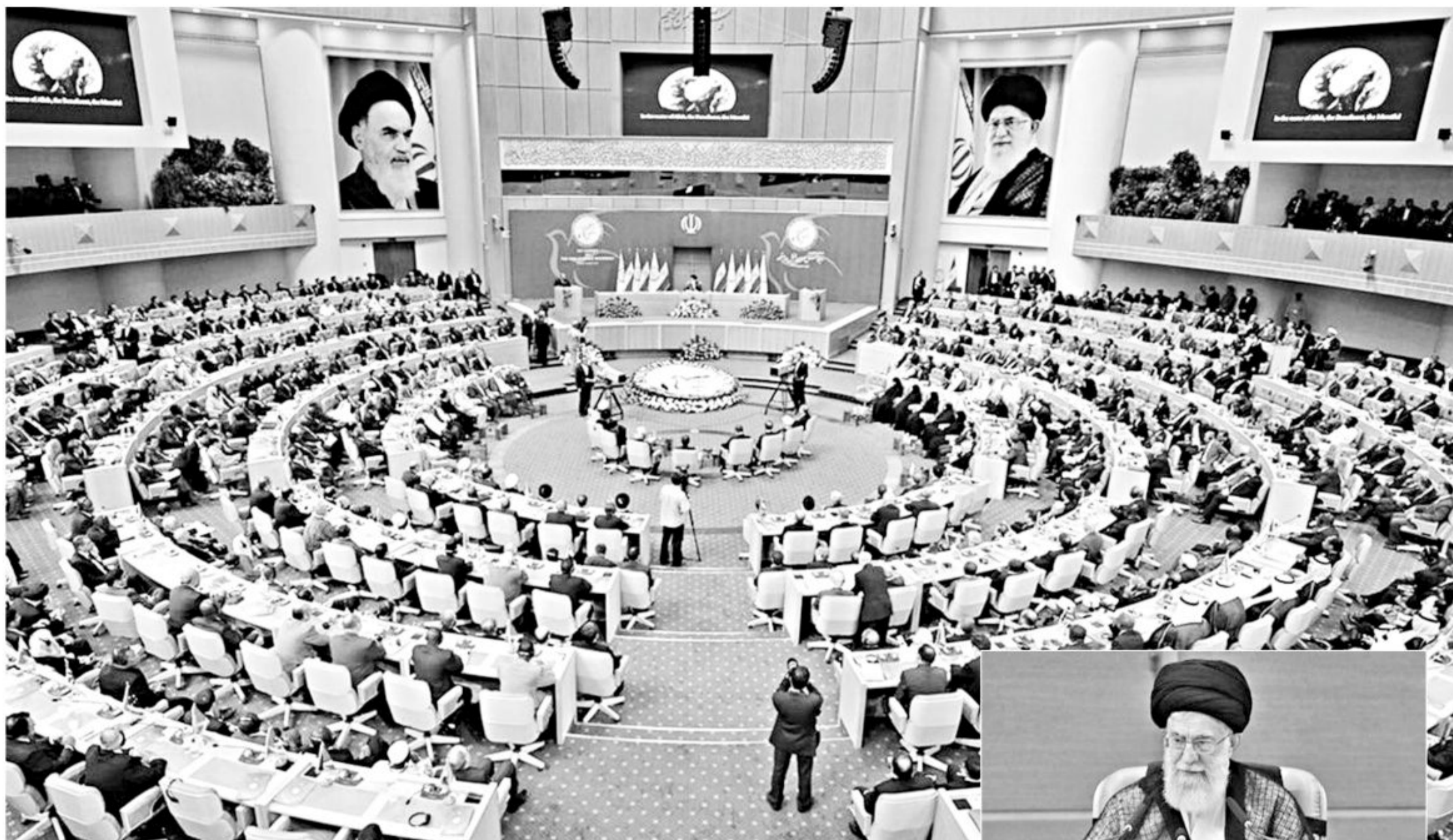
A general view of the opening session of the 120-member Non-Aligned Movement summit held in Tehran yesterday, inset, Iran's Supreme leader Ayatollah Ali Khamenei addresses the two-day summit.

A total of 29 heads of state or government are attending the Tehran summit, including those of Afghanistan, India, Iraq, Lebanon, Pakistan, the Palestinian Authority, Sudan, Qatar and Zimbabwe. North Korea was represented by its ceremonial head of state, parliamentary president Kim Yong-Nam, rather than the country's leader Kim Jong-Un.