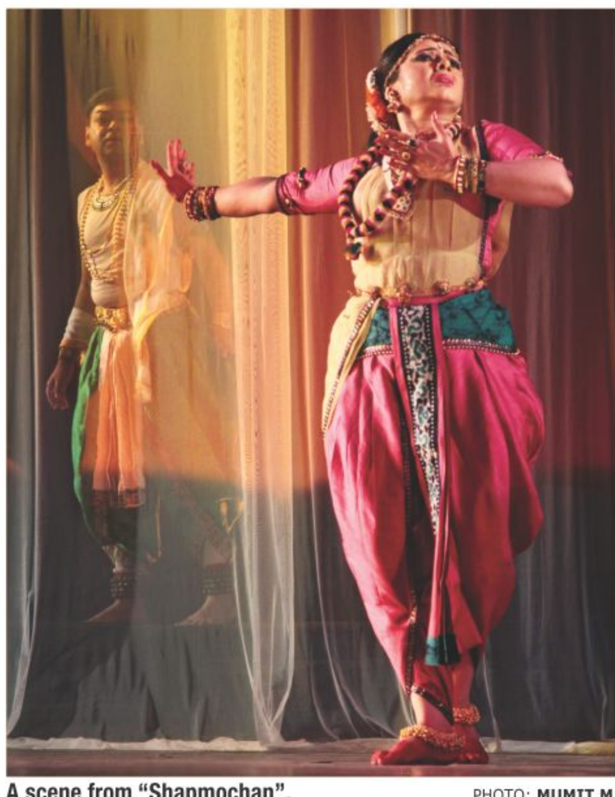
A scene from "Shapmochan".

Entry ticket will be available at the counter prior to the show and will cost Taka 200 and Taka 150 respectively.