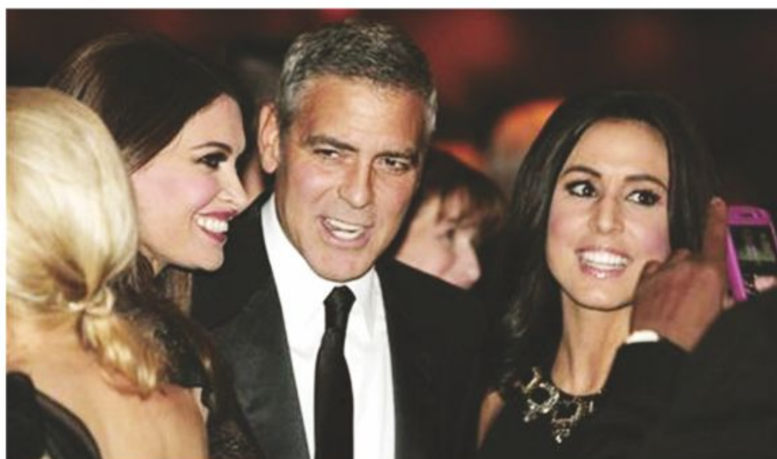
Clooney attends the White House Correspondents Association annual dinner in Washington April 28 this year.

It will be a significant workshop for those who are interested to learn more about sound and its implementation in films, documentaries and plays. The workshop will also focus on modern techniques and technology of different aspects of sound.