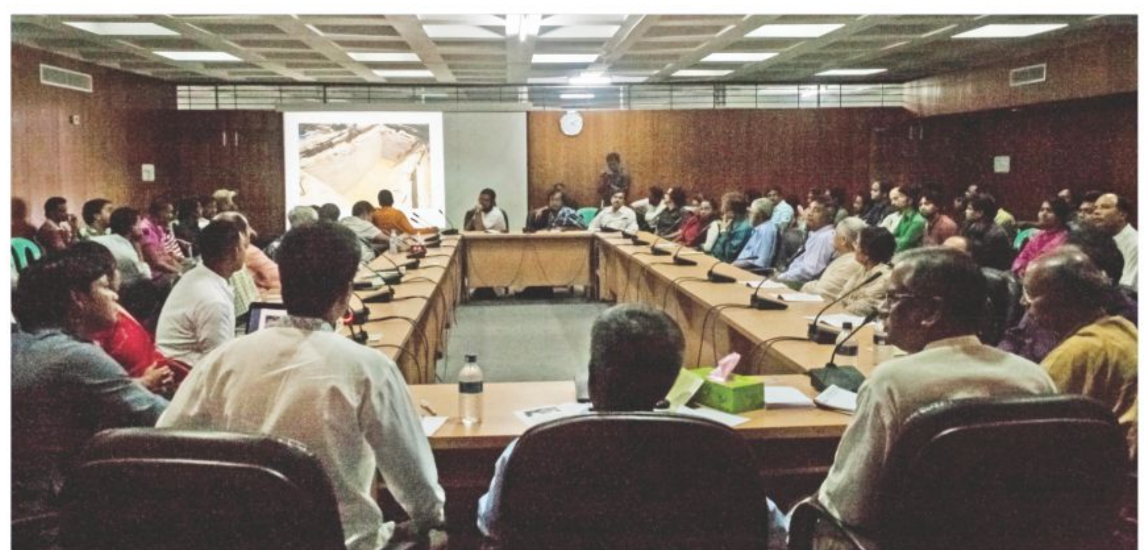
Experts, theatre activists, teachers and students take part in the seminar.