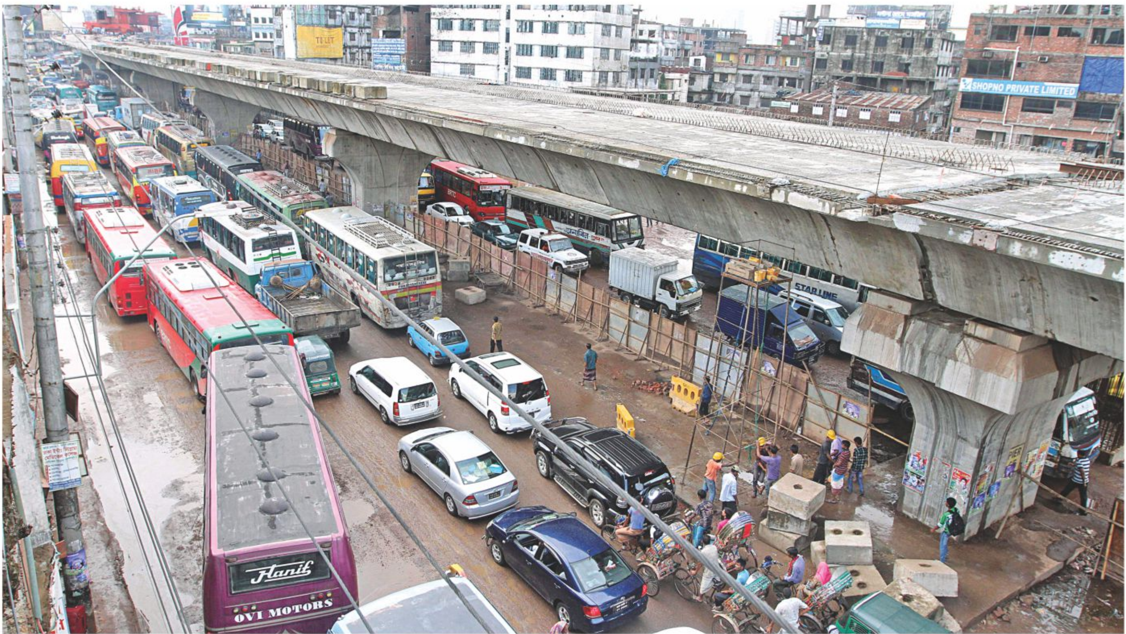
This Jatrabari-Gulistan flyover will be open to the public on the next Independence Day, according to the state minister for LGRD and cooperatives. For his part, the administrator of Dhaka South City Corporation, the implementing agency of the project, said it would be ensured that the ongoing utility relocation for the flyover was completed within a week.