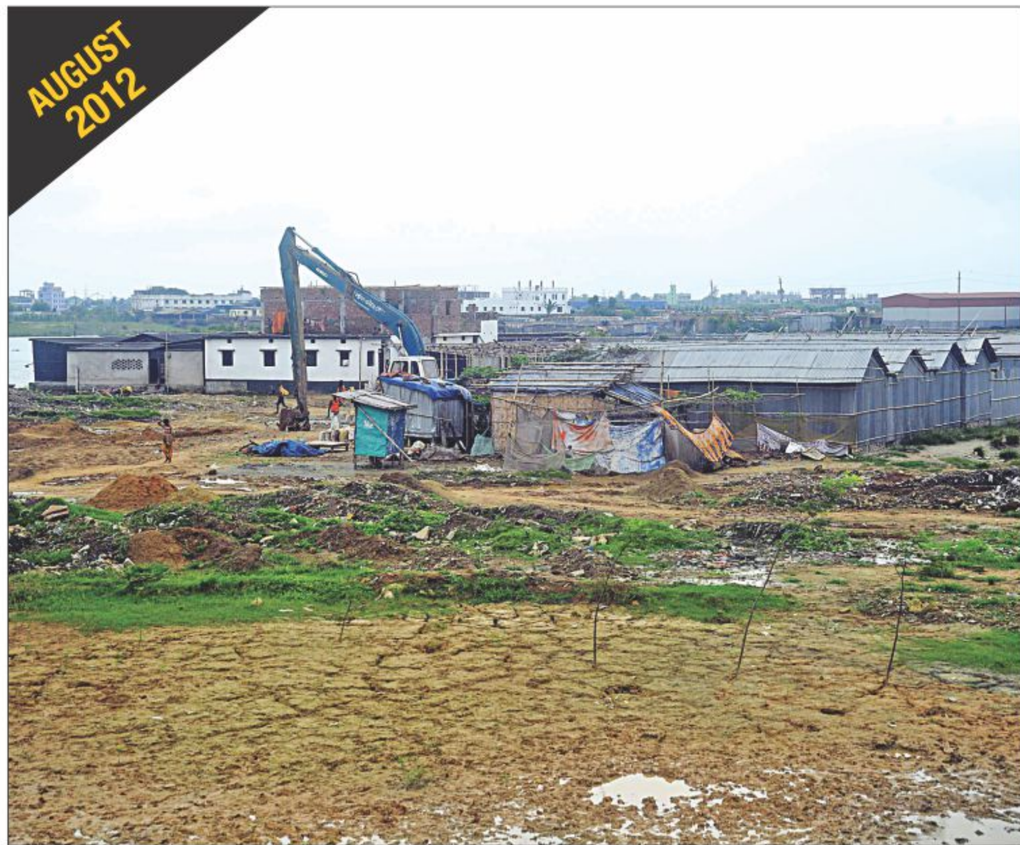
Left, a photo shot yesterday shows a number of structures built on this filled-up stretch of Haikkar Khal, just behind the Martyred Intellectuals Memorial in the capital. Land grabbers continue to fill up the canal that once flowed through here before emptying into the Buriganga. Right, in another picture shot on December 6, 2010, numerous signboards claim ownership of the stretch of land.