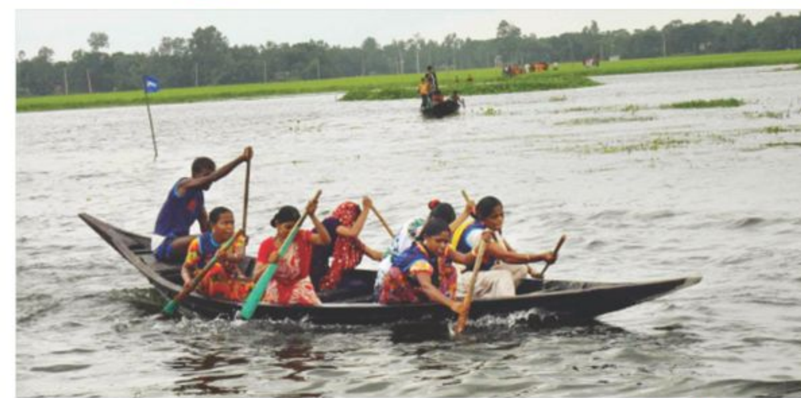
Around 100 boats plied by 1,500 men and women from different places of the district participated in four categories.

The celebration will end through a screening of "Jodha Akbar" on September 8 evening. (Entry is by invitation only)